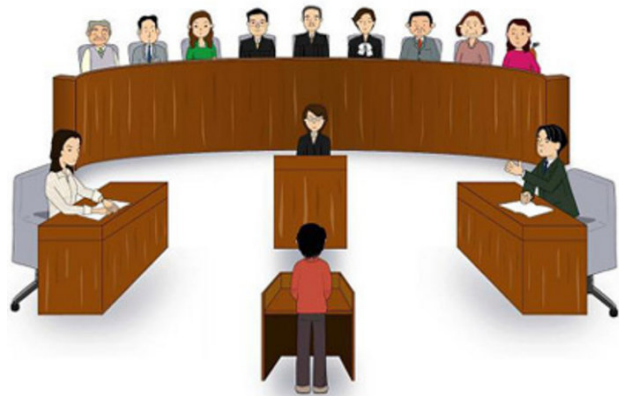
The lay judge system

judges to welcome the demise of an institution that made it more difficult for the state to convict. 1