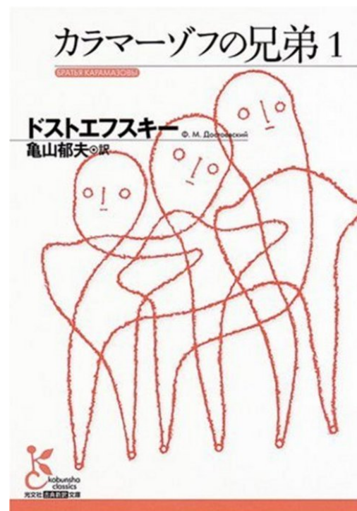
The Brothers Karamazov in new Japanese

nonetheless people have been complaining that the old canon of world literature is no longer being taken seriously. And so this new Karamazov boom was a pleasant surprise. But I asked how this new translation of the novel could be so different that suddenly hundreds of thousands of Japanese readers were in such a hurry to buy it and were reading it with such enthusiasm. Even in times when literature supposedly had many more readers than today, Dostoevsky was never a bestseller.