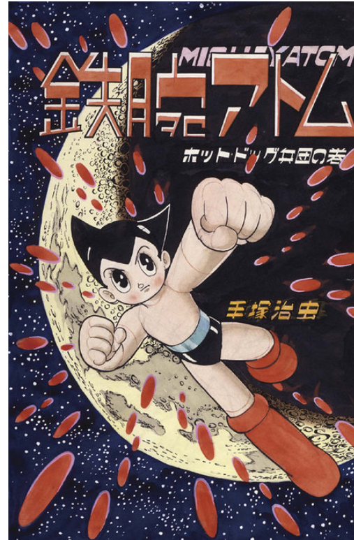
Tezuka Osamu's Astro Boy

The rhythm of manga reading is produced in part by the circumstance that the images alternate artfully with the dialogue. It occurred to me that in this sense I could easily imagine the new translation as a manga. The first picture shows a beetle. In the second picture I see a speech bubble containing Gregor's question: "What has happened to me?" Someone wakes up and realizes that he has a different body than before: a typical manga scenario, familiar from "Astro Boy" or "Black Jack." The third picture is a sketchily drawn view of the room: a wall, a table and textiles. All the pictures are printed in black and white. The fourth picture is a picture inside a picture, which you often see in manga. Gregor has cut the portrait of a lady out of a magazine and framed it.