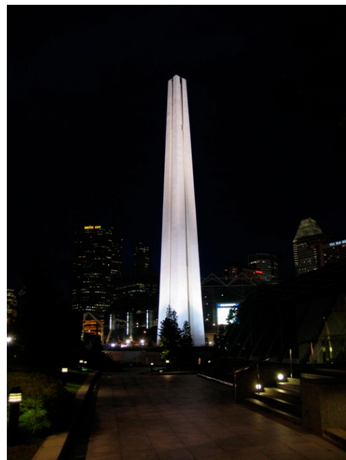
Civilian war monument

monuments and museums. Singaporeans of all communities are rather well apprised of most aspects of the Japanese wartime occupation. Most Singaporean school children can point to battle sites and execution grounds. They can also name heroes of various races lost in defense of the island, though probably few are aware of the role of communist youth working alongside the British.