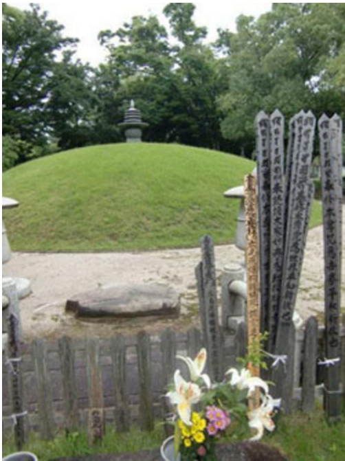
Grassy knoll: The Atomic Bomb Memorial Mound in Hiroshima holds the ashes of 70,000 unidentified victims of the bomb.

Global fashion icon Issey Miyake recently made headlines by divulging in a New York Times article he penned on July 13 that he is a hibakusha, a survivor of the atomic bombings of Japan.