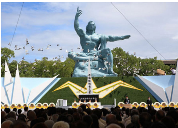
Doves fly in Nagasaki on August 9, 2009 at 11:02 a.m.

While one can lead us to “a world without nuclear weapons,” the other will carry us toward annihilation, bringing us to suffer once again the destruction experienced in Hiroshima and Nagasaki 64 years ago.