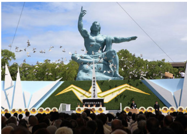
Doves fly in Nagasaki on August 9, 2009 at 11:02 a.m.

While one can lead us to “a world without nuclear weapons,” the other will carry us toward annihilation, bringing us to suffer once again the destruction experienced in Hiroshima and Nagasaki 64 years ago.