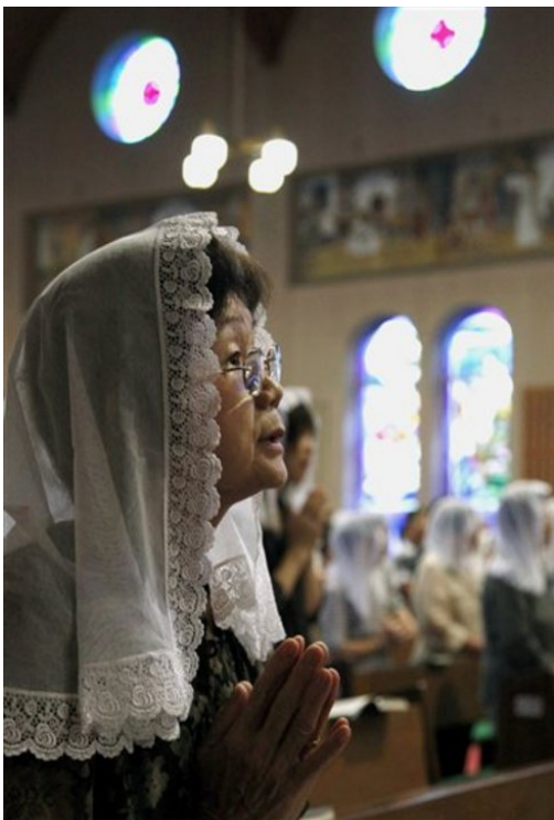
A woman prays in Nagasaki's Urakami Cathedral on Aug 9, 2009.

hibakusha are not reconciled, and are still waiting for an apology. Even after they die, the people of Hiroshima and Nagasaki and the descendants of hibakusha will still demand justice and keep the issue alive, just as in Nanjing the Chinese have sustained their campaign for justice. It won't fade away. The past continues to haunt the present.