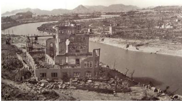
Ground Zero, Hiroshima, August 6, 1945.

Global fashion icon Issey Miyake recently made headlines by divulging in a New York Times article he penned on July 13 that he is a hibakusha, a survivor of the atomic bombings of Japan.