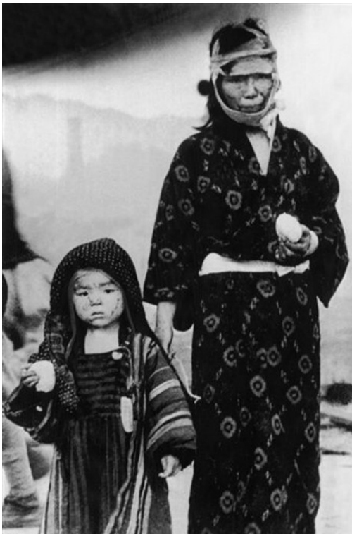
Mother and child, Nagasaki Aug 9, 1945.