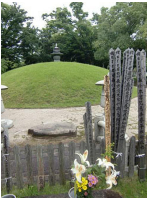
Grassy knoll: The Atomic Bomb Memorial Mound in Hiroshima holds the ashes of 70,000 unidentified victims of the bomb.

Global fashion icon Issey Miyake recently made headlines by divulging in a New York Times article he penned on July 13 that he is a hibakusha, a survivor of the atomic bombings of Japan.