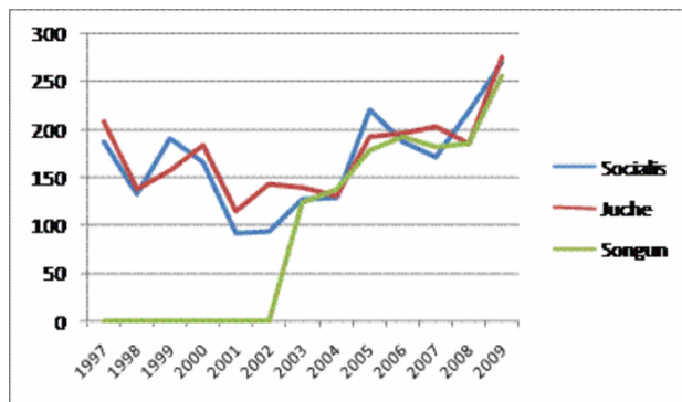
Number of KCNA articles with the terms “socialist/ socialism”, “juche” and “songun” in

Kim Jong-il now seems to be trying to turn back the wheel of time. Today, we see a complete reversal of the policies of 2000-2004. In January 2001, in the official Rodong Sinmun newspaper, Kim Jong-il wrote: “Things are not what they used to be in the 60s. So no one should follow the way people used to do things in the past.” However, in March 2009 he declared that officials should “energetically lead the masses by displaying the same work style as the officials did in the 50s and 60s.” We can chart this march backwards: The utilization of the terms “socialism,” “chuch’e” (the official state ideology of North Korea) and “sŏn’gun” (the government’s “military first” policy) by North Korean state media has doubled from 2004 to 2009.