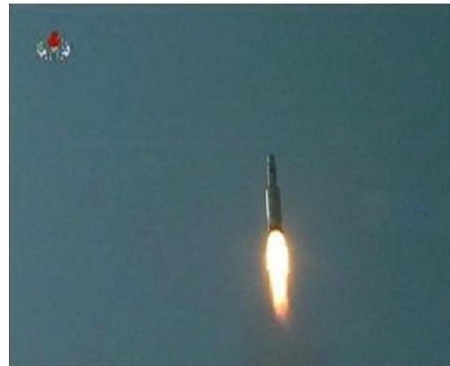
Taepodong-rocket launched in April 2009 by North Korea

( http://www.nautilus.org/fora/security/08032.Frank.html ) that emphasizes self-reliance and mass campaigns, cracks down on previously promoted market activities and stresses anti-imperialist struggle more fiercely than throughout most of the last decade.