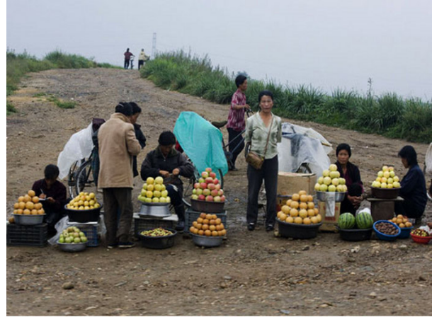
Roadside market in North Korea

The major point is that within a relatively short time North Koreans discovered, many for the first time, that there is life outside the grace of the state. They suddenly realized the power of money. Their values changed accordingly and moved closer to what most of the world considers as a given. They understood that money can secure livelihood, buy power and even health, and that, unlike the state with its politically motivated favors, money is largely impartial. The socialist system of economic management and political guidance started to look outdated. The once largely egalitarian society experienced a swift diversification – suddenly there were winners and losers, many unanswered questions and growing individual ambitions.