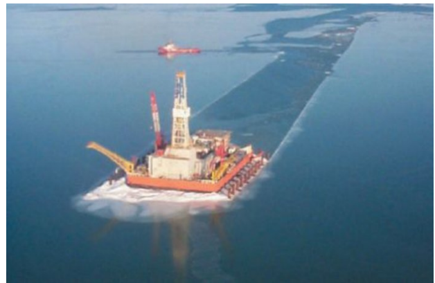
Kashagan oil field

starts in 2013. This spells, of course, Liquid War. Wily Kazakh President Nursultan Nazarbayev would like to use the Russian-controlled Caspian Pipeline Consortium (CPC) to pump Kashagan crude to the Black Sea.