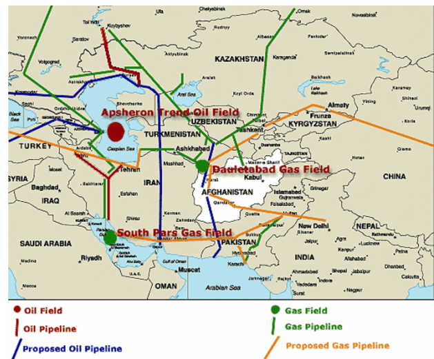
Map showing Central Asian completed and projected pipelines

All geopolitical junkies need a fix. Since the second half of the 1990s, I've been hooked on pipelines. I've crossed the Caspian in an Azeri cargo ship just to follow the $4 billion Baku-Tbilisi-Ceyhan pipeline, better known in this chess game by its acronym, BTC, through the Caucasus. (Oh, by the way, the map of Pipelineistan is chicken-scratched with acronyms, so get used to them!)