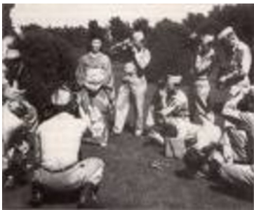
GIs photographing women