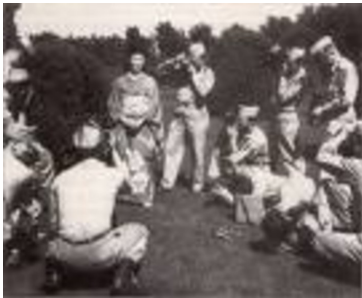
GIs photographing women