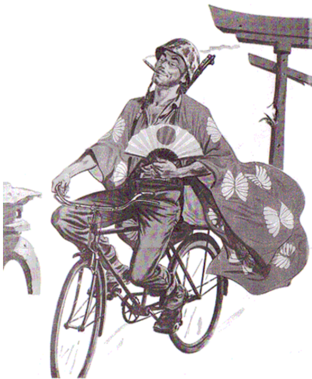
Colliers magazine cover depicting US-GIs in the thrall of Japan

military commanders who retain enormous discretion, particularly in an investigation's early stages, such as the preliminary inquiry. If an officer decides that reporting a rape would be detrimental to military objectives, he may not report it. A recent example is a case in which the military discharged a US soldier accused of raping and murdering a 12-year-old Iraqi girl rather than trying him. 1