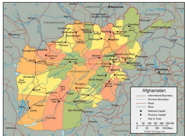
Map of Afghanistan

I covered the front as a US armed forces war correspondent, accompanying the army's 1-503 Rifle Infantry Company "Alpha" which is deployed in Spira, in Afghanistan's eastern Khost province.