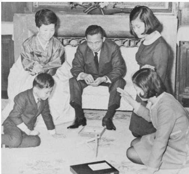
Park Chung Hee with his wife and children, playing yunnori on a New Year's Day

In the final section below, I will discuss what these recollective representations of Park reveal about the collective wishes and longings of the Korean public. They imply competing popular visions of a desirable society.