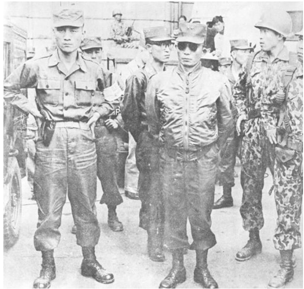
Park Chung Hee during the military coup in May 1961.