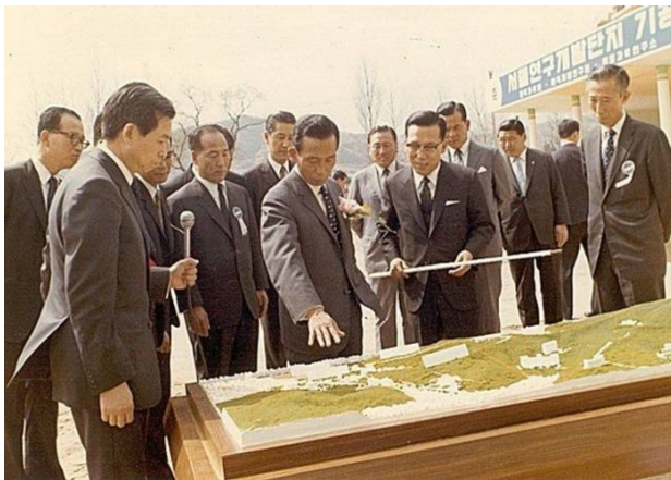
Park Chung-hee (center) as a resolute and diligent leader who directs public officials.