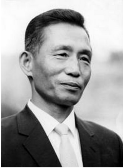
Park Chung Hee as a patriotic and modest leader