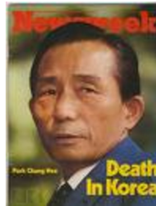
Death of a dictator

to foster Park’s negative legacy in order to distance himself from Park, both despite and because of his apparent resemblance to him. Despite its repressive control of the mass media, Chun’s regime allowed for the production and consumption of publications and television programs critical of the Park era. 8 This type of tolerance appears to have been an attempt to redirect popular criticism against Chun’s own undemocratic regime.