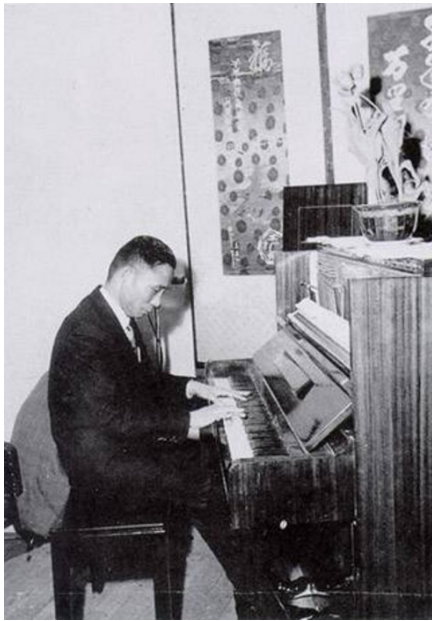
Park at the piano.