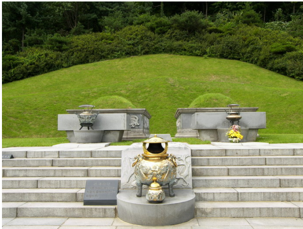
Tomb of Park Chung Hee

hero” for his defense of the Korean nation from Japanese invasion during the late 16th century). 17