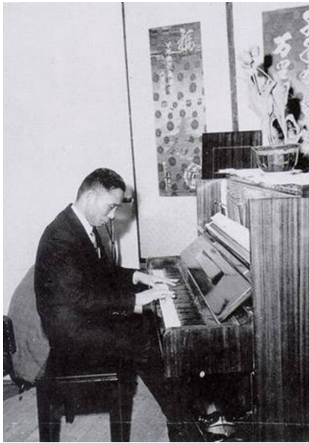
Park at the piano. (Cyber Park Chung Hee memorial hall)