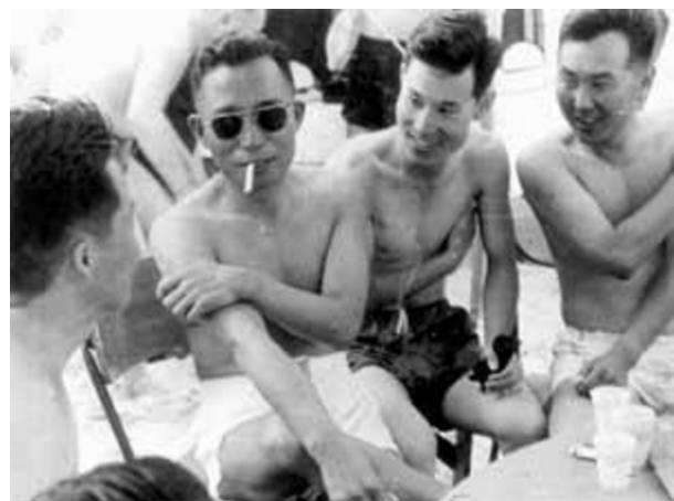
Park Chung Hee (with sun glasses) with two journalists and the mayor of Pusan (the first from the right) in the Haeundae Beach, Pusan in the early 1960s (description based on Un-hyön

These remarks also convey the self-righteousness that blinded Park, particularly during the last decade of his rule. At the pinnacle of political power, he believed that he had a heroic destiny to save the nation and that the people had no choice but to follow his leadership.