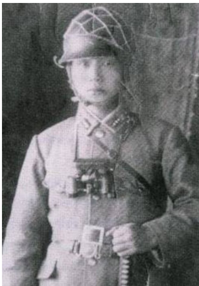
Young Park Chung Hee in Japanese Army officer uniform in Manchuria (circa June, 1944):

economic development justified the pervasive use of violence and other repressive measures to deal with conflict and differences among diverse social groups. In particular, the organized violence of the military and the police were mobilized against those who failed to comply with Park's leadership. As a result, society was profoundly militarized, and individual citizens were reduced to instruments of the state, which was sanctified as the guarantor of collective prosperity and security; industrialized Korea became a society where the brutal logic of power has ensured the survival of the fittest and the public tends to be skeptical of the democratic practices of communication and deliberation for their apparent inefficiency in obtaining immediate or urgent goals.