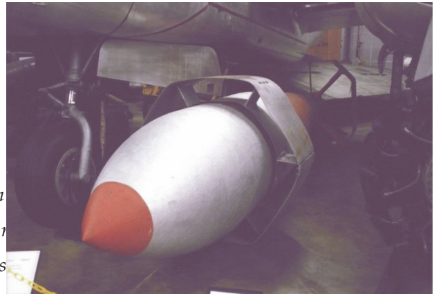
The Tarzon bomb

Airpower embodies American technology at its most dashing. At regular intervals, the air force and allied technocrats claim that innovations in air technology herald an entirely new age of warfare. Korea and Vietnam were, so to speak, living laboratories for the development of new weapons: the 1,200-pound radio-guided Tarzon bomb (featured in Korean-era Movietone newsreels); white-phosphorous-enhanced napalm; cluster bombs (CBUs) carrying up to 700 bomblets, each bomblet containing 200 to 300 tiny steel balls or fiberglass fléchettes; delayed-fuse cluster bombs; airburst cluster bombs; toxic defoliants; varieties of nerve gas; sets of six B 52s, operating at altitudes too high to be heard on the ground, capable of delivering up to thirty tons of explosives each.