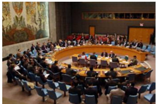
UN Security Council

thought missile, some thought satellite. Unable to agree on a noun, it therefore compromised with the verb "launch." The Council's strong and peremptory diplomatic language - "condemns," "demands," etc - was therefore oddly out of kilter with its inability to decide what it was condemning. Essentially it was saying North Korea was not to launch any more unidentified flying objects, or "UFOs." "Whatever it was you launched," said the Security Council in effect, "you should not have and you must not do it again."