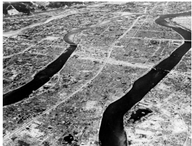
Aerial view of Hiroshima after the bombing.

inauspicious place for a reasoned discussion of the unconditional surrender issue. The same could be said of the targeting issue. If the intransigence of Japanese leaders, abetted by the American delay in clarifying surrender terms, ultimately made the use of the bomb inevitable, it did not necessarily follow that it had to be used without warning against cities and civilians. But once again Potsdam proved to be a poor venue in which to belatedly revisit the complicated technical and operational issues related to nuclear targeting. Though Stimson (with Truman's assent) did manage to keep Kyoto off the targeting list, his ruminations on "the killing of women and children" were not enough to overcome the momentum toward city targeting that began at Los Alamos and was ratified by the Target Committee and Interim Committee in late May.