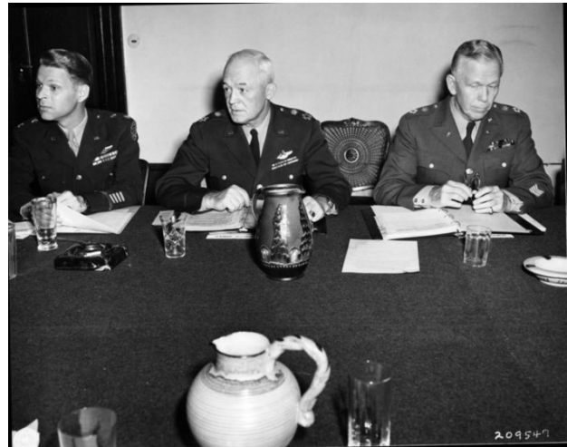
Lauris Norstad (left), Henry “Hap” Arnold (center), and Marshall (right) at the Potsdam Conference

endorsement of the deliberate destruction of an entire city, sharply contrasted with Stimson's thinking about the conduct of the war as well as Marshall's explicit suggestion that a military target should be given first priority.