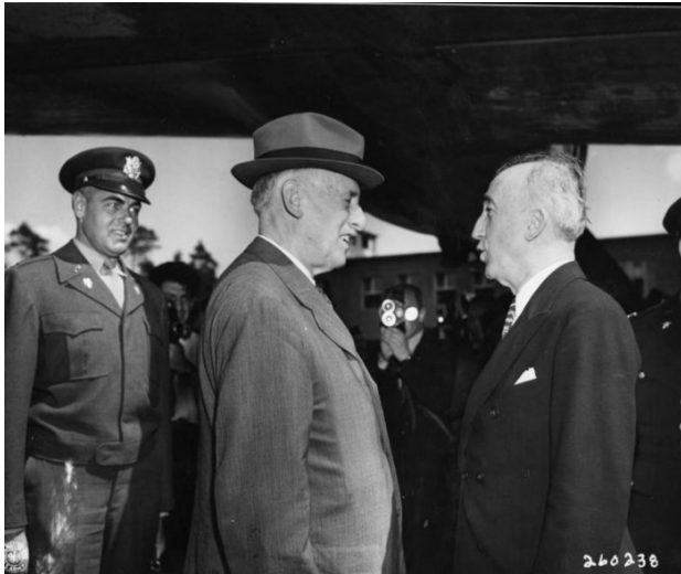
Stimson and Secretary of State James F. Byrnes at Potsdam.

bomb's effects on "surrounding communities" and "the killing of women and children." [69]