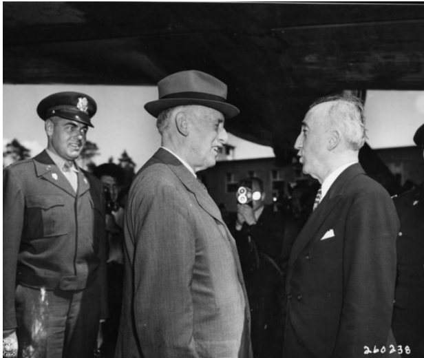
Stimson and Secretary of State James F. Byrnes at Potsdam.

bomb's effects on "surrounding communities" and "the killing of women and children." [69]