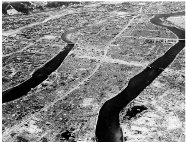
Aerial view of Hiroshima after the bombing.

inauspicious place for a reasoned discussion of the unconditional surrender issue. The same could be said of the targeting issue. If the intransigence of Japanese leaders, abetted by the American delay in clarifying surrender terms, ultimately made the use of the bomb inevitable, it did not necessarily follow that it had to be used without warning against cities and civilians. But once again Potsdam proved to be a poor venue in which to belatedly revisit the complicated technical and operational issues related to nuclear targeting. Though Stimson (with Truman's assent) did manage to keep Kyoto off the targeting list, his ruminations on "the killing of women and children" were not enough to overcome the momentum toward city targeting that began at Los Alamos and was ratified by the Target Committee and Interim Committee in late May.