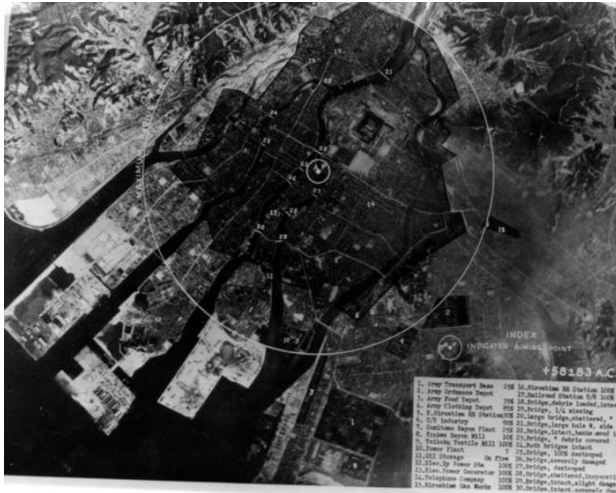
Post-strike targeting photograph of Hiroshima

removal of Kyoto from the target list, as a lamentable but ultimately acceptable compromise.[56]