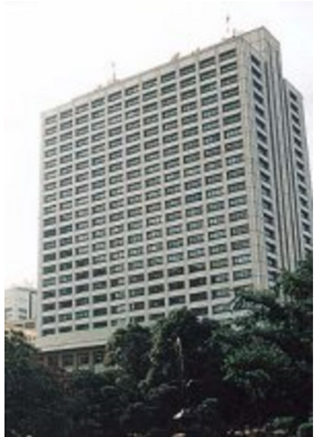
The Ministry of Labor, Tokyo

Furthermore, while unions were not wholly blind to the anticipated result of the deregulation, they were not greatly concerned with the problems of dispatched workers because they were not union members. Japanese unions have for decades been basically enterprise-based organizations, unions whose membership is usually limited to the regular employees of the enterprise, especially in the manufacturing sector. Dispatched workers have typically been excluded from these unions.