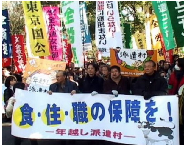
Hakenmura residents march to the Diet on January 5, 2009 demanding food, housing and jobs

The name of the camp is Toshikoshi Hakenmura, roughly translatable as “New Year’s Eve Village for Dispatched Workers (the full term for “dispatched worker is “Haken Rōdōsha”). In recent years, Japanese employment agencies have been dispatching thousands of workers on short-term or temporary contracts to manufacturing companies such as automakers. But in late 2008, many of these contracts were suddenly canceled as manufacturers responded to the recession by reducing production (these cancellations are termed “haken-giri” or “dispatch cuts.”). During the period of their contract, these workers had typically been housed in dormitories for temporary employees. As their contracts were cancelled, the workers were ordered to leave the dormitory. In the current economic climate, the dispatching agency was hardly able to provide