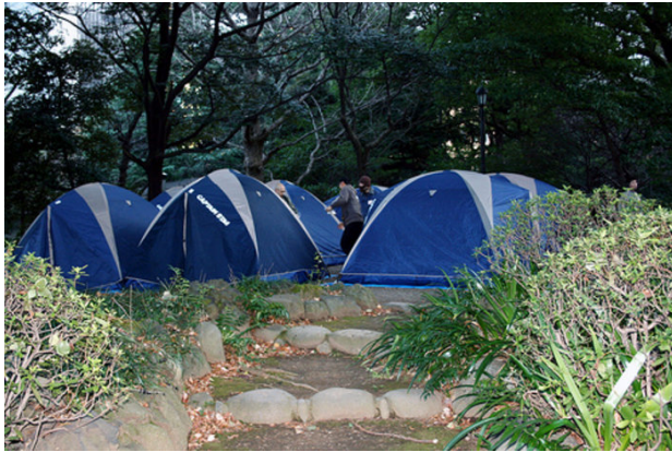
Tents at Hakenmura

counseling and employment consulting services, and helped the residents apply for welfare benefits. The residents pitched tents for their lodgings, but the space was cramped and it was hard to sleep with nighttime temperatures around the freezing point.