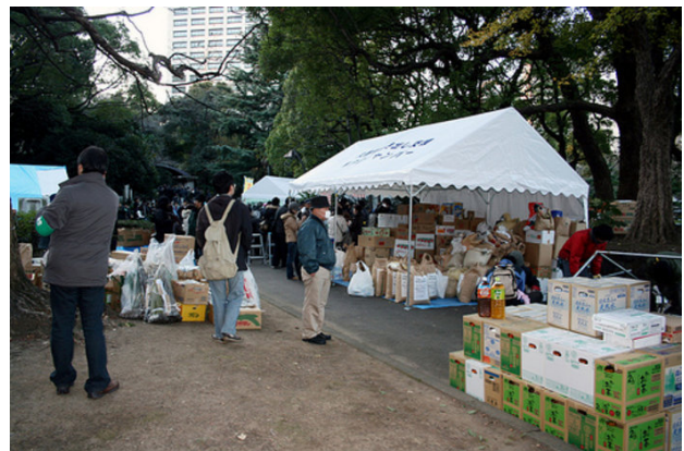
Supplies for Hakenmura

new jobs to these unemployed workers. Many soon found themselves indigent, and some were homeless, compelled to sleep on park benches in the cold night. Very few homeless shelters are available in Japan in any case, and because relevant public offices are closed, the holiday season is the hardest time for these homeless. This was the context for the opening of the Toshikoshi Hakenmura.