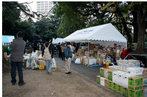
Supplies for Hakenmura

new jobs to these unemployed workers. Many soon found themselves indigent, and some were homeless, compelled to sleep on park benches in the cold night. Very few homeless shelters are available in Japan in any case, and because relevant public offices are closed, the holiday season is the hardest time for these homeless. This was the context for the opening of the Toshikoshi Hakenmura.