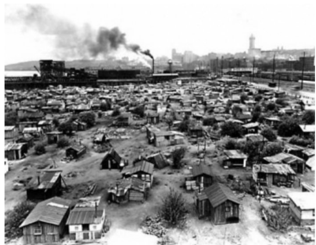
An American depression: Hooverville

“Hooverville” was the term coined to describe the numerous shanty towns created by homeless men during the Great Depression in various American cities, an ironic reference, of course, to president Herbert Hoover. Nearly 80 years ago the spectacle of these Hoovervilles pushed Roosevelt and American labor politics toward the New Deal. In this light, one is led to wonder about the political significance of the similarly ironically named “New Year Hakenmura.” Does it indicate a tipping point in Japanese labor politics?