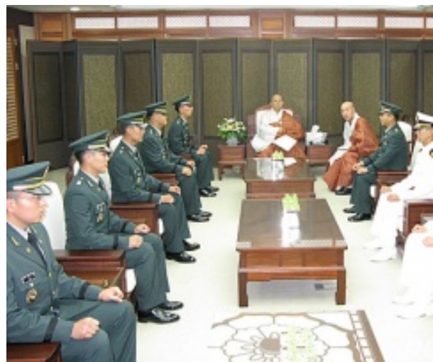
Buddhist chaplains (kunsŭng) in the Korean