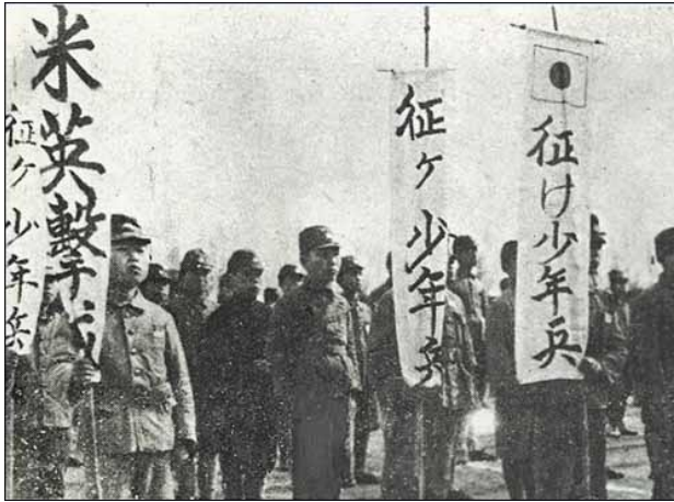
Korean youths conscripted by the Japanese authorities in the last years of the Pacific War

Conscription, first applied to Korean subjects of the Japanese Empire by Japanese colonial authorities in 1943 (promulgated March 1, effective August 1), was reintroduced soon after the establishment of the post-colonial Korean state on August 15, 1948. The first Military Duty Law (pyöngyökpöp), promulgated on August 6, 1949, drew largely on colonial precedents and continental European (German and French) models, putting all male citizens under the age of 40 under service obligations, requiring those whose obligations were unfulfilled to return from sojourns abroad before reaching the age of 26 (and prohibiting anybody above this age from traveling abroad until fulfillment of the service obligations). Exceptions were only made for those declared medically unfit, criminals, or delinquents. 26 In anticipation of the coming all-out conflict with the competing regime in the Northern part of the peninsula and wishing to