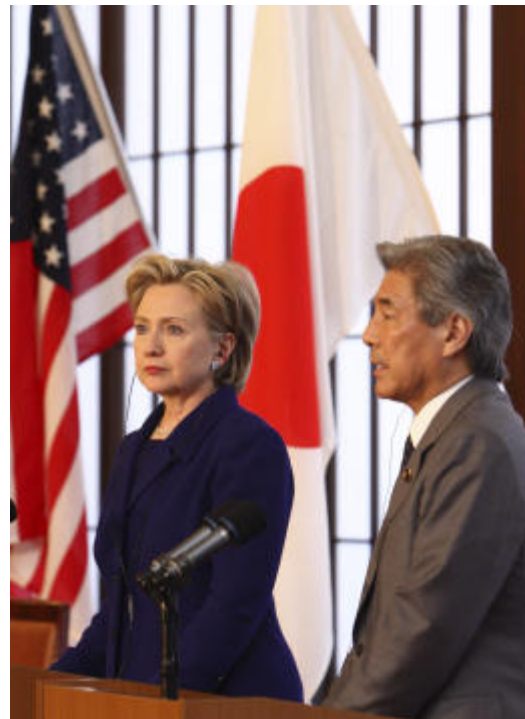
Clinton and Nakasone

her first mission as Secretary of State of the new Obama administration. The following day, she and Japanese Foreign Minister Nakasone Hirofumi (son of former Prime Minister Nakasone Yasuhiro - as in 18 th century England, most Japanese political leaders have inherited their positions, and are second, third, or fourth generation politicians of what in England used to be called "rotten" or "pocket" boroughs) signed an Agreement, nominally on the transfer of Marines from Okinawa to Guam.