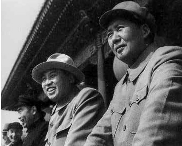
Kim Il-Sung and Mao in October 1964