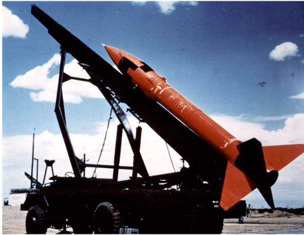
Honest John rocket

and 16 metric tons respectively. Plus, there was no NATO border fronting on the Soviet Union within the range of these weapons, rendering them basically obsolete in Europe. Thus, South Korea was the "only place in the world" where the U.S. could secretly deploy soon to be scrapped nuclear weapons and effectively target the Soviet Union.