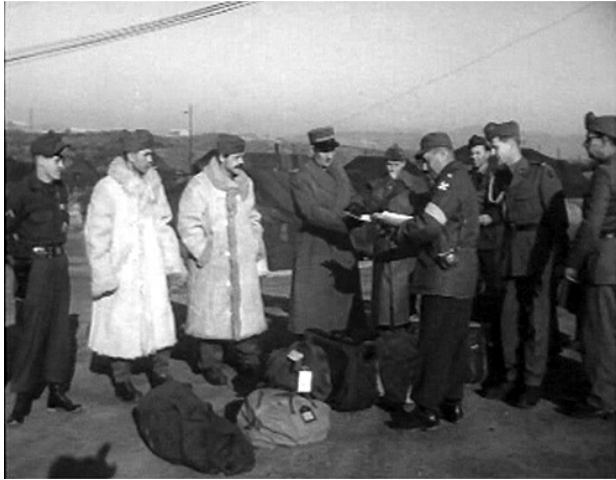
Swiss members of the NNSC depart for Korea, 1954