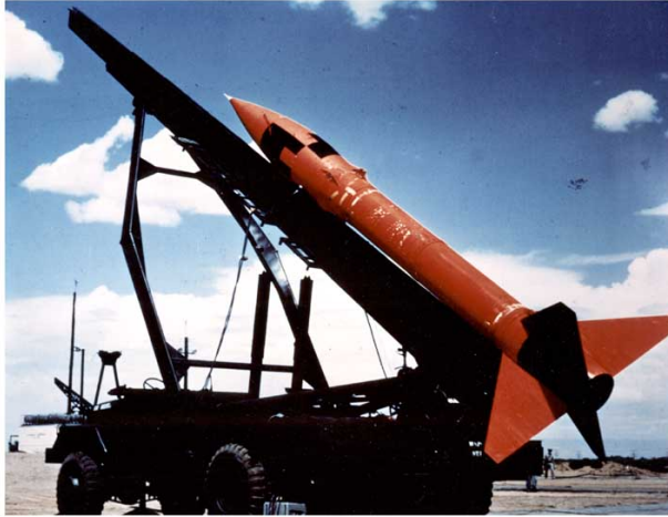
Honest John rocket

and 16 metric tons respectively. Plus, there was no NATO border fronting on the Soviet Union within the range of these weapons, rendering them basically obsolete in Europe. Thus, South Korea was the "only place in the world" where the U.S. could secretly deploy soon to be scrapped nuclear weapons and effectively target the Soviet Union.