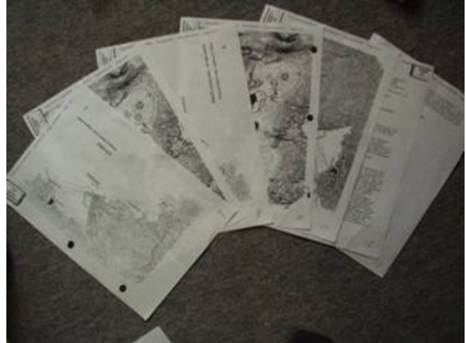
DoD court documents