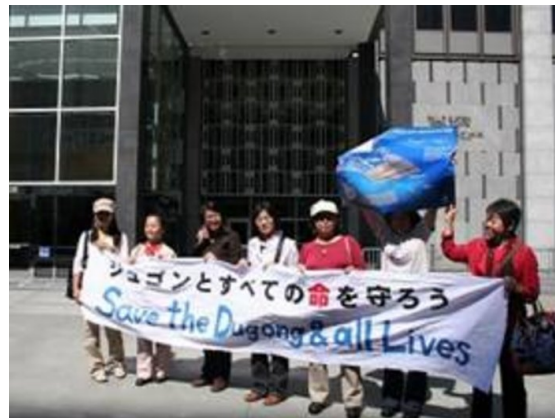
Dugong supporters in front of US court building

winning architect, both well-recognized environmental activists in Okinawa, were plaintiffs.