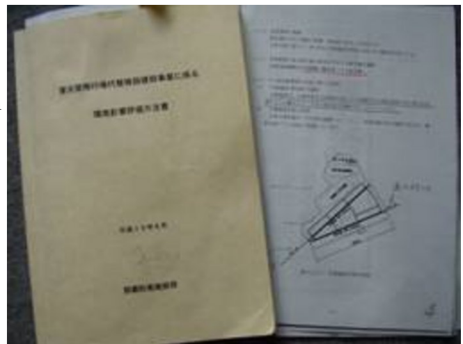
The scoping document showing a crude outline of the airport

There were two main reasons for the widespread criticism of the scoping document. First, it lacked necessary information regarding the construction plan, making the scientific validity of the EIA's final outcome questionable. [27] It provided no clear information on the types of aircraft that would be operated and flight routes that the aircraft would take; it failed to mention the dugong as an "endangered species" listed in Okinawa prefecture's "red list" although the document recognized the dugong as a "natural monument" listed in the Japanese Register of Cultural Properties; and it provided no information on mitigation and/or avoidance measures, should there be any negative effects on the dugongs.