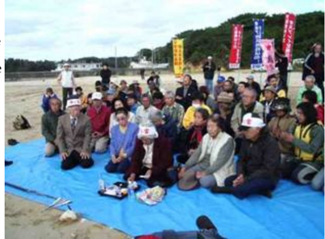
Praying to the sea god is an integral part of the anti-base construction movement