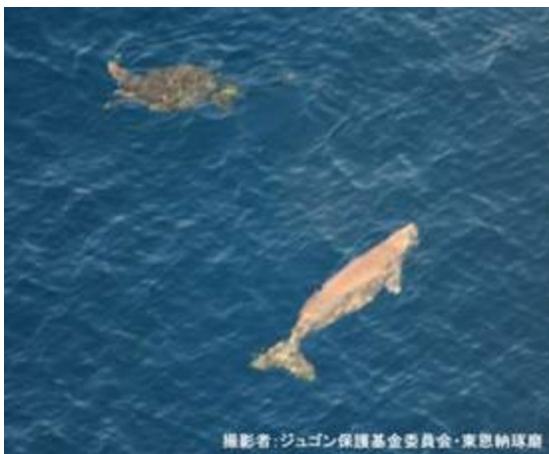
Dugong and sea turtle in Oura Bay