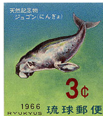
Ryukyu Postal’s stamp to commemorate the dugong’s designation as a natural monument in 1966

To be sure, the dugong has always been of cultural and historical significance in Okinawa in the “conventional” sense of culture.[72] In the Omoro Soshi, the 16 th century compilation of ancient poems and songs of Okinawa and Amami, the dugong was depicted as a symbol of abundance and happiness. During the era of the Shuri Kingdom, dugong meat was regarded as a delicacy and a tribute to the King. Legends of the dugong, as a messenger of the sea god who warned people to avoid tsunami or as a creature who taught human beings how to procreate, have been passed on from generation to generation. Rituals portraying the dugong as a messenger of the Sea God are still performed in some communities.[73] It is these historical and cultural aspects of the dugong that define the dugong as a “natural monument” in Japan and that brought about the dugong lawsuit in the first place.