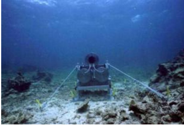
Video-camera set up in the dugong's pathway