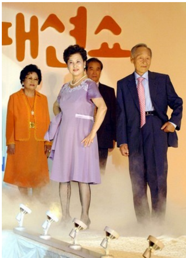
Korea’s aging population

consists of the elderly (those 65 years or older). If current population trends continue, the country will transition to an “aged society” in 2019, when 14 percent of the population will be elderly. Korea will become a “superaged society” by 2026, when the elderly would make up 20 percent of the population.