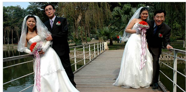
Korean men marry Vietnamese women in Vietnam

The proportion of intermarriages in total marriages in Korea has jumped more than ten-fold since 1990, accounting for nearly 14 per cent in 2005. This coincided with the growing number of migrant workers in Korea (see Table 2). The soaring number of international marriages is also due to a significant growth in the number of "picture brides" from abroad.