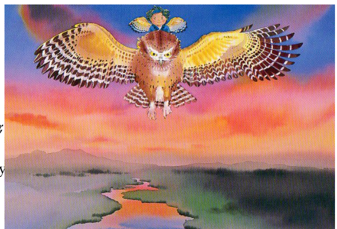
The owl and the child

Chiri Yukie's book contains thirteen songs of gods such as the owl, fox, rabbit, little wolf, sea, frog, otter, and swamp mussel deities, and the spirit of the damp ground. "Silver Droplets Fall" is the first of her collection, and one of the two owl god songs. The owl (or more precisely, in Horobetsu, Blakiston's eagle-owl) is kotan-kor-kamuy , the guardian god of the kotan (hamlet).