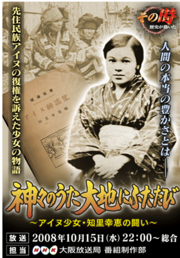
NHK poster for the Chiri Yukie installment of the "Sono toki rekishi wa ugoita."