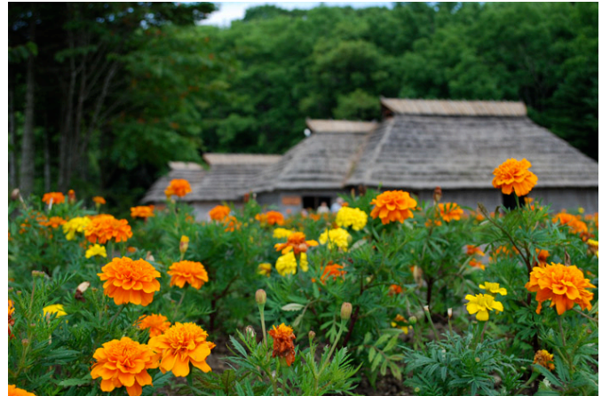
Chise, Ainu home

kamuy yukar was customarily sung by women, while yukar was traditionally sung by men, although female bards took over the latter by the mid-twentieth century when few male bards were left. 4 )