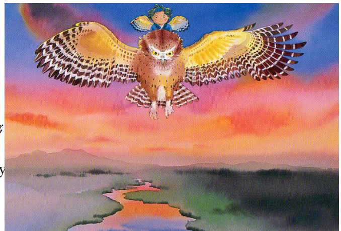
The owl and the child

Chiri Yukie's book contains thirteen songs of gods such as the owl, fox, rabbit, little wolf, sea, frog, otter, and swamp mussel deities, and the spirit of the damp ground. "Silver Droplets Fall" is the first of her collection, and one of the two owl god songs. The owl (or more precisely, in Horobetsu, Blakiston's eagle-owl) is kotan-kor-kamuy , the guardian god of the kotan (hamlet).