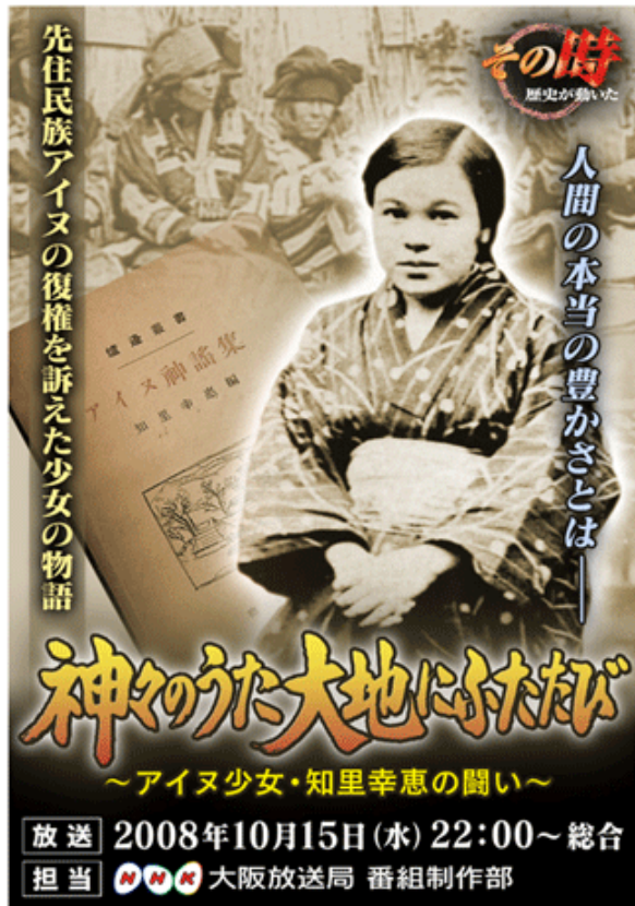
NHK poster for the Chiri Yukie installment of the "Sono toki rekishi wa ugoita."