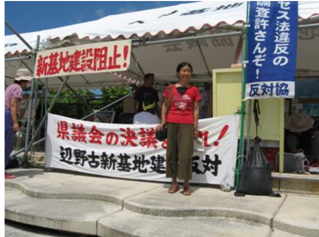
October 2008

While the Government of Japan represented itself to the world at fora such as the Lake Toya Summit in 2008 as sensitive to green and environmental considerations, in Okinawa it proceeded with a threefold assault on some of Japan's most precious natural assets: the coral reef and the sea at Henoko in the north where it planned a major new base for the US Marine Corps, Yambaru forest, also in the north, where it planned a chain of helipads for US attack helicopters, and Okinawa City, where it would sacrifice Japan's most "rain-forest" rich marine environment in order to create something for which the court had just ruled that there was no rational purpose.