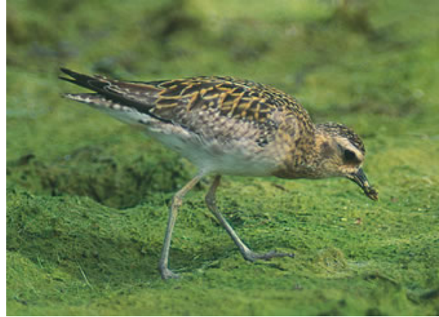
Munaguro - Pacific Golden Clover

project and of development along the East coast of Okinawa Island. Since reclamation has been so widespread along so much of the Okinawan coast-line, it is a near miracle that such a large wetland (265 hectares), astonishingly rich in biodiversity, should have survived just adjacent to Okinawa prefecture's second largest city, Okinawa City. Awase Tidal Wetlands, typical of Japan's coral reef coastal wetlands, comprises a continuous bio-system from mud flats through sea weed and sea grass to coral reef, rich in species, including endangered and precious species such as blue mud-skipper ( Tokagehaze , Scartelaos histophorus ) and Kubiremidoro (an endangered or critically endangered marine algae, Pseudodichotomosiphon constricta ). More migratory birds come here in search of food than anywhere else in Okinawa, including especially snipe and plover. 52.3 per cent of the Munaguro (Pacific Golden Plover, Pluvialis dominica ) that winter in Japan [en route between Siberia and Australia] do so at Awase tidal wetlands.