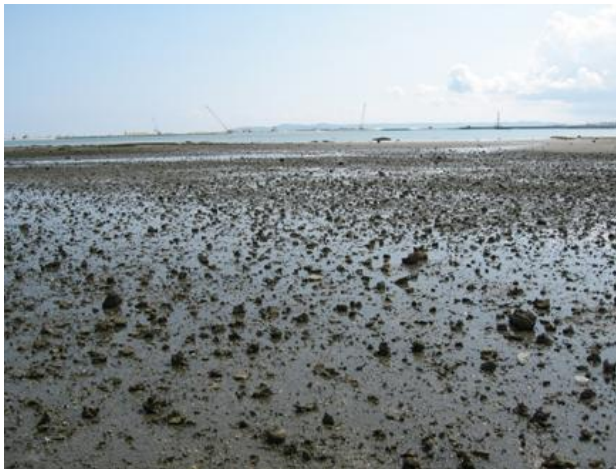
Awase Wetland October 2008

Acclaimed by Okinawan newspapers as “a complete victory for the complainants,” the judgment could be seen as the fruit of a determined local movement – diligently guiding visitors around the wetlands site, making use of the internet, photographic exhibitions, concerts and so on to inform people at the level of their everyday life, and engaging in discussions at national, prefectural, and city levels.