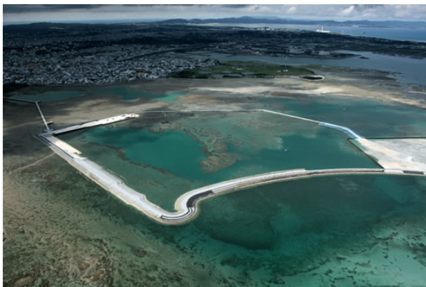
Awase Reclamation Zone (as of October 2008)

were conducted (till 1999, when the Environmental Assessment law came into operation, cabinet assent was the only requirement) and at the end of 2000 approval was given for reclamation of 187 hectares [including 49 hectares of coral-sandy rubble tidal flat, 79 hectares of sea grass bed, and 47 hectares of reef]. At the beginning of the following year, 2001, citizens and others opposed to the reclamation formed the Liaison Committee for the Protection of the Awase Tidal Wetlands (hereafter: Liaison Committee) and called on the prefecture to conduct a “resident audit.” The prefecture refused.