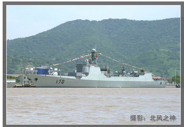
Chinese Aegis Destroyer

would participate in anti-piracy operations near Somalia. The motives for this decision seem to be a combination of the desire to give more operational experience to the Chinese Navy and to demonstrate China’s newfound status as a “responsible stakeholder” in the international community.