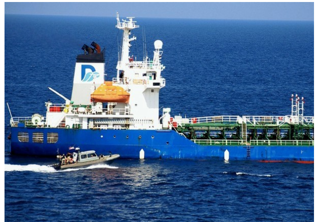
The Golden Nori

In late October 2007 an odd story appeared in the press. A Japanese-owned chemical tanker called the Golden Nori was hijacked off the coast of Somalia. There were no Japanese nationals on board, but the East Asian nation had become entangled, quite unusually, in an East African affair. Unforeseen at that time was that this curious incident would eventually become one of the top foreign policy issues in Tokyo: Somali piracy has emerged as a potential turning point for Article Nine of the Japanese Constitution, and is significant for other reasons as well. The following essay reviews the record of Japanese encounters with Somali pirates and explores the motives and political pressures driving the Maritime Self-Defense Forces (MSDF) toward a proactive role in suppressing East African piracy.