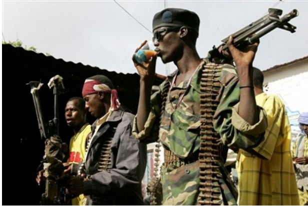
Militia from the Islamic Courts Union

Aside from plunging the Somali people back into their long war, the Ethiopian and American interventions also allowed the piracy problem to reach its current proportions. Some of the same warlords that have received US support for their anti-ICU credentials also seem to be playing a low-key role in letting the pirates carry out their activities. The government of Eritrea, which supports the ICU, has explicitly blamed Washington for the piracy problem. In a November 2008 statement, Asmara charged: