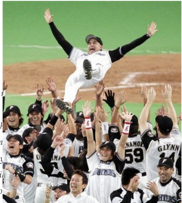
ICCND October, 2008 meeting

The issue of nuclear war and nuclear disarmament have repeatedly been submerged in recent years by issues of terrorist attack and wars such as those in the Congo, Rwanda, Afghanistan, Iraq and Gaza. But a former Foreign Minister Gareth Evans recently pointed out at the October meeting of the Australian Japan International Conference on Non-Proliferation and Disarmament, "The truth of the matter is that there are at the moment, depending on how you calculate these things, somewhere between 13,000 and 16,000 nuclear warheads actively deployed, a great many of them still on hair-trigger alert even though the Cold War has been long over. And between them having a phenomenal destructive capability. The reality also is that we are on the brink - after years and years of containing rather well the emergence of new nuclear weapon states, with all the risks of either deliberate or accidental use of nuclear weapons that flows from the existence of nuclear weapons or nuclear arms proliferation . . ."