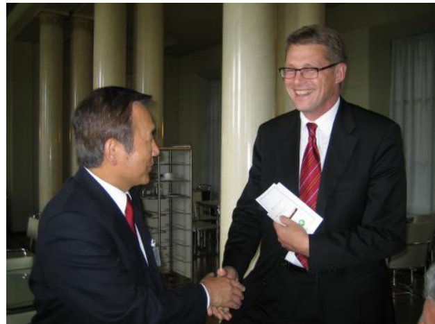
Hiroshima Mayor Akiba Tadatashi with Prime Minister of Finland promoting Peace 2020

initiative supported by 236 cities in 134 countries and regions of the world to abolish all nuclear weapons. MOFA’s comments also reflected the Japanese government’s recognition of the legitimacy of the Article VI of the Nuclear Non-proliferation Treaty that calls for complete nuclear disarmament. Speaking for herself, Ms. Kawaguchi criticized the nuclear deal recently struck between the United States and India.