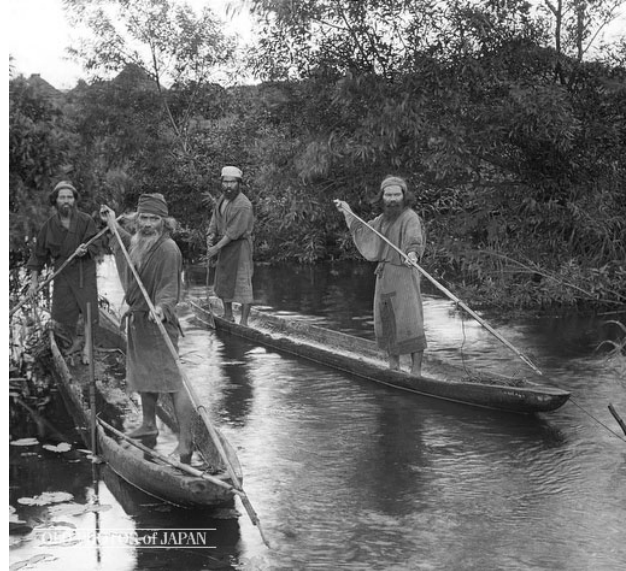
Ainu fishermen c. 1900

It is crucial to heed the fact that the expropriation of territory and their rights to life proceeded simultaneously and parallel to the process by which the Ainu, a term connoting a proud person or people, was transformed into the humiliating term “native” ( dojin ), a word indicating a savage or uncivilized people. Because, when we turn our attention to this historical fact, we can immediately understand that the operation of the representation of the subject (from human to “native”) and the material destruction and expropriation of non-capitalist society are two deeply imbricated strategies. Racism (one form of the representation of the subject) justifies the operation of reification in capitalism (in a Lukascian sense) as natural - social relations amongst human beings are formed through the mediation of things (the commodity), and thus humans themselves come to exist as things or commodities. The slave trade, in other words, the exemplary commodification of human beings, cannot be explained without an understanding of the justifications of racism or its operations of representation, nor can we understand the history of the expropriation of the Ainu without considering the relationship between racism and reification.