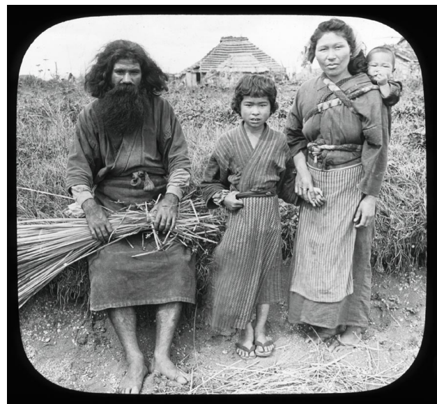
Ainu family, 1906

Seen in this way, we can understand that the discourse of “opening” operates as a universalistic expression of the ethnic enterprise and its progressiveness. A society like that of the Ainu, possessing neither the form of the nation-state nor the structure of capitalism, is thus posited as an ethnicity which utterly lacks the ability to manage itself, to say nothing of the ability to “open” frontiers. It is the “undeveloped” or “childlike” remnant left behind by the historical law of “progress,” one whose only option is to survive through the leadership and patronage of a more “progressive” ethnicity. Consequently, historicism and ethnocentrism resolve themselves in reducing the rich historical experience of mankind to the binary structure of “progress or stagnation,” and each ethnicity is thereby rewritten into a narrative of its oscillating rise and fall.