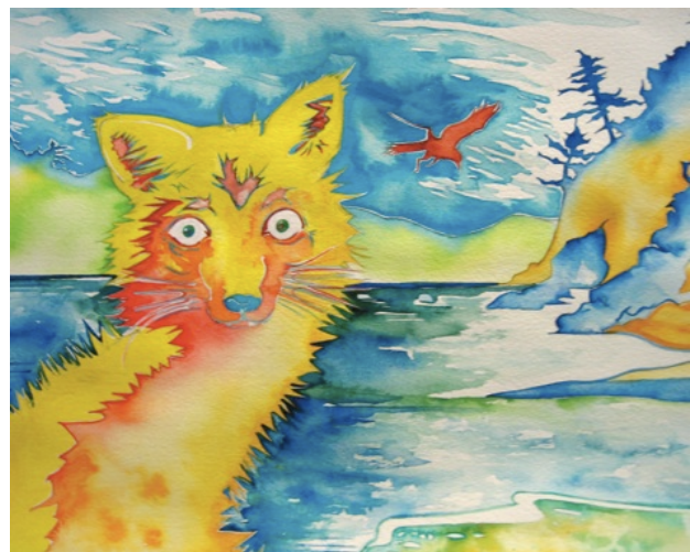
Representation of Chiri Yukie’s “Fox’s Song”