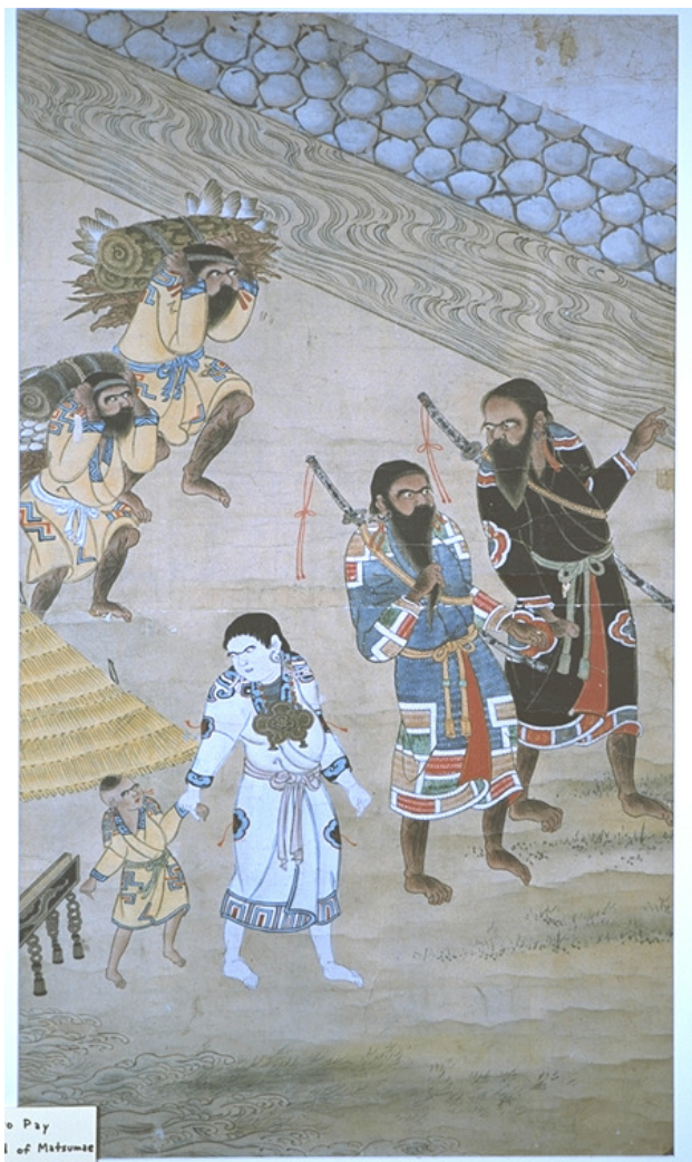
Ainu group in a Japanese representation in Edo

brotherhood, and treated as national citizens." [3]