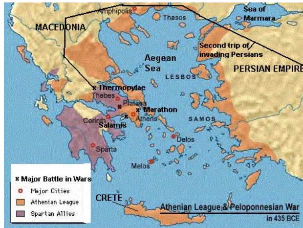
Thermopylae, 480 BC