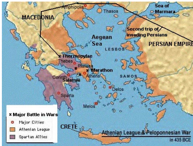
Thermopylae, 480 BC