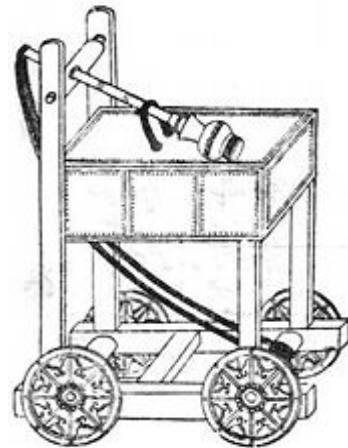
A Trebuchet catapult of 1044 used to launch the earliest type of explosive bombs

industrial revolution began in the 11th century, in Song dynasty China? This dynasty produced 125,000 tonnes of iron in 1078, seven centuries before Britain managed to produce 76,000. The Chinese mastered advanced technologies like iron casting and substituted coke for charcoal to prevent deforestation. During the same period they revolutionised transport, energy (the water mill), taxation, trade and urban development. Their green revolution attained levels of agricultural production that Europe did not match until the 20th century.