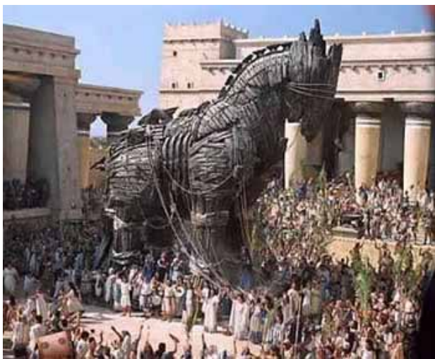
The Trojan horse

the centuries, as the Trojans were succeeded by the Persians, the Persians by the Phoenicians, the Phoenicians by Parthians, the Parthians by the Sassanids, the Sassanids by the Arabs, and the Arabs by the Ottoman Turks... The battle lines have shifted over time, and the identities of the antagonists have changed. But both sides' broader understanding of what it is that separates them has remained, drawing, as do all such perceptions, on accumulated historical memories, some reasonably accurate, some entirely false." [2]