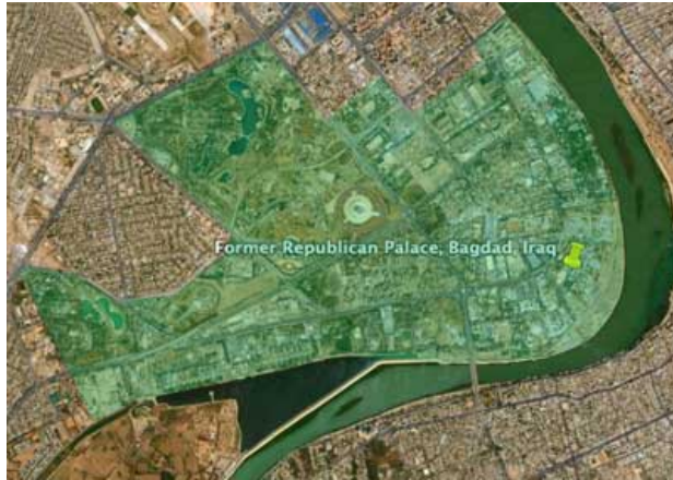
The Green Zone

Security has improved with police and military checkpoints everywhere but sectarian killers have also upgraded their tactics. There are less suicide bombings but there are many more small sticky bombs placed underneath vehicles. Everybody checks underneath their car before they get into it. I try to keep away from notorious choke points in Baghdad, such as Tahrir Square or the entrances to the Green Zone, where a bomber can wait for a target to get stuck in traffic before making an attack. The checkpoints and the walls, the measures taken to reduce the violence, bring Baghdad close to paralysis even when there are no bombs. It can take two or three hours to travel a few miles. The bridges over the Tigris are often blocked and this has got worse recently because soldiers and police have a new toy in the shape of a box which looks like a transistor radio with a short aerial sticking out horizontally. When pointed at the car this device is supposed to detect vapor from explosives and may well do so, but since it also responds to vapor from alcohol or perfume it is worse than