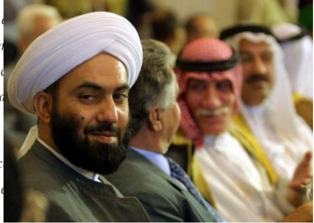
Iraq parliament deliberates on the agreement

On November 27 the Iraqi parliament voted by a large majority in favor of a security agreement with the US under which the 150,000 American troops in Iraq will withdraw from cities, towns and villages by June 30, 2009 and from all of Iraq by December 31, 2011. The Iraqi government will take over military responsibility for the Green Zone in Baghdad, the heart of American power in Iraq, in a few weeks time. Private security companies will lose their legal immunity. US military operations and the arrest of Iraqis will only be carried out with Iraqi consent. There will be no US military bases left behind when the last US troops leave in three years time and the US