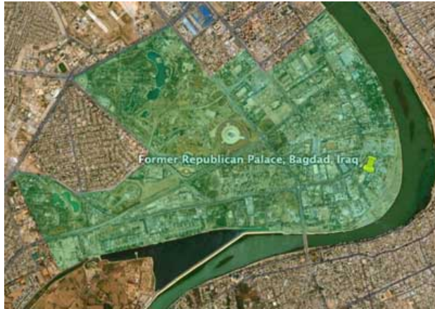
The Green Zone

Security has improved with police and military checkpoints everywhere but sectarian killers have also upgraded their tactics. There are less suicide bombings but there are many more small sticky bombs placed underneath vehicles. Everybody checks underneath their car before they get into it. I try to keep away from notorious choke points in Baghdad, such as Tahrir Square or the entrances to the Green Zone, where a bomber can wait for a target to get stuck in traffic before making an attack. The checkpoints and the walls, the measures taken to reduce the violence, bring Baghdad close to paralysis even when there are no bombs. It can take two or three hours to travel a few miles. The bridges over the Tigris are often blocked and this has got worse recently because soldiers and police have a new toy in the shape of a box which looks like a transistor radio with a short aerial sticking out horizontally. When pointed at the car this device is supposed to detect vapor from explosives and may well do so, but since it also responds to vapor from alcohol or perfume it is worse than