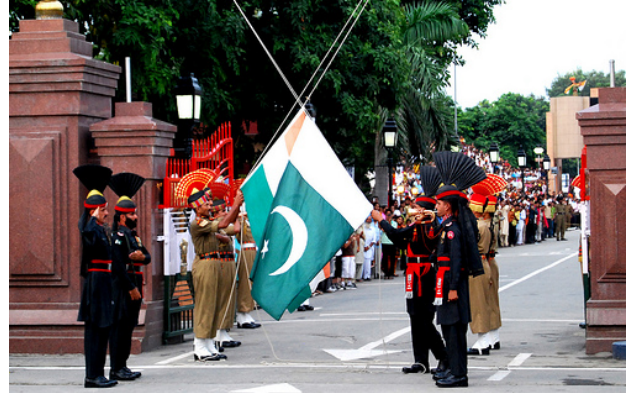
Ceremonial changing of the Pakistani guard at the Wagah India-Pakistan Border

Any proven involvement by Pakistani state institutions in the Mumbai attack would be a calamity for Pakistan-India relations and, by extension, America's strategy for South Asia.