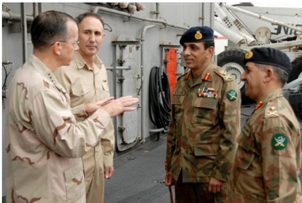
ISI head Maj. Gen. Ahmad Shuja Pasha (right) with Chairman of the US Joint Chiefs of Staff, Adm. Mike Mullen (left) in an August 27, 2008 meeting.

On November 28, Indian Prime Minister Manmohan Singh asked his Pakistani counterpart Yousuf Raza Gilani to dispatch the Director General of ISI, one Lieutenant General Shuja Pasha, to India to receive Indian findings concerning the TeL links of the attackers and “share information”.