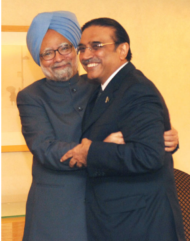
Manmohan and Zardari

However, Minister of Information Sherry Lehman, the Benazir Bhutto lookalike who is the guardian of Zardari's political fortunes and the relationship with the United States, refused to let the matter rest, declaring that caller-ID technology revealed that the offending call had indeed originated in India's Ministry of Foreign Affairs, provoking an exasperated denial ( http://economictimes.indiatimes.com/PoliticsNation/Pranab_takes_hoax_state_to_task/articleshow/3806209.cms ) in turn from Mukherjee.