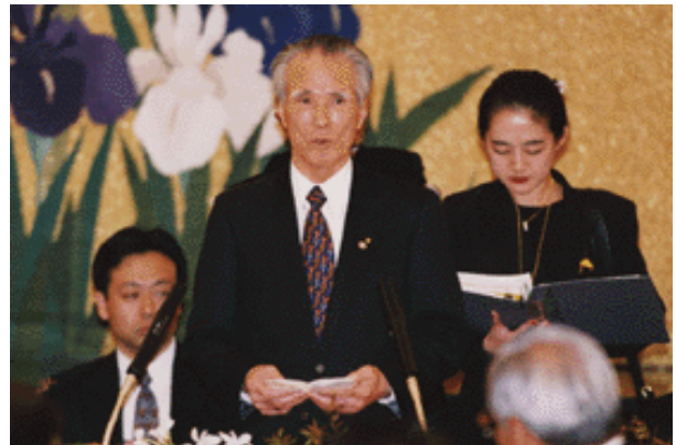
Prime Minister Murayama Tomiichi in a 1995 speech

In Northeast Asia the record on this score is mixed. It was 1995, a half century after the end of the Japanese colonial empire, before Japanese Prime Minister Murayama Tomiichi expressed Japan's regret and apology for the pain and harm done by the four decades of colonialism. A few years later, a similar apology was extended to cover the Comfort Women and in 1998 that apology was explicitly directed to South Korea (by Prime Minister Obuchi).