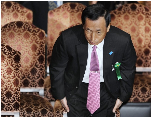
Tamogami testifying on November 11, 2008.

being used as "a tool to suppress free speech."