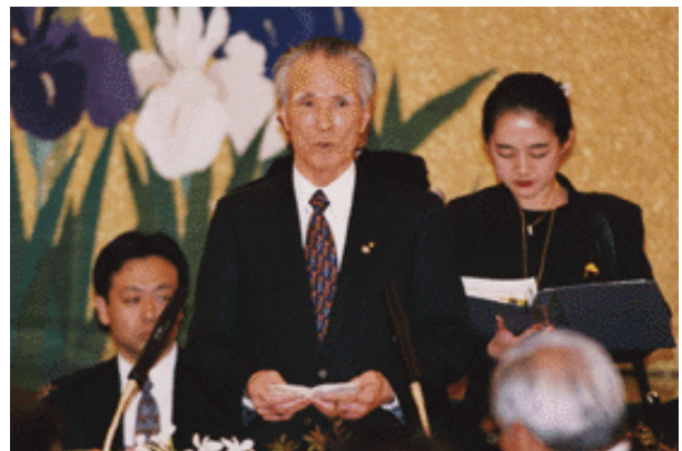
Prime Minister Murayama Tomiichi in a 1995 speech

In Northeast Asia the record on this score is mixed. It was 1995, a half century after the end of the Japanese colonial empire, before Japanese Prime Minister Murayama Tomiichi expressed Japan's regret and apology for the pain and harm done by the four decades of colonialism. A few years later, a similar apology was extended to cover the Comfort Women and in 1998 that apology was explicitly directed to South Korea (by Prime Minister Obuchi).