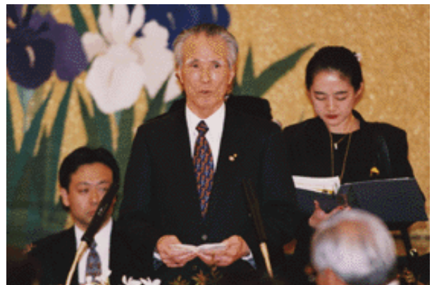
Prime Minister Murayama Tomiichi in a 1995 speech

In Northeast Asia the record on this score is mixed. It was 1995, a half century after the end of the Japanese colonial empire, before Japanese Prime Minister Murayama Tomiichi expressed Japan's regret and apology for the pain and harm done by the four decades of colonialism. A few years later, a similar apology was extended to cover the Comfort Women and in 1998 that apology was explicitly directed to South Korea (by Prime Minister Obuchi).