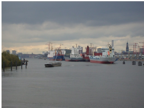
Ships at anchor

LIBOR (the London inter-bank lending rate) and the Ted Spread (the difference between 3-month Treasury Bills and the 3-month LIBOR); but even so, the flow of credit does not appear to be circulating beyond the big banks and into the broader economy. And now these risk measures are creeping up again, as financiers ponder the implications that a long and deep recession will have for asset values and the securities they are built on.