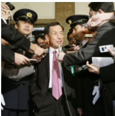
Gen. Tamogami enjoying the spotlight following his dismissal

By early November 2008, every major newspaper and mainstream television station in Japan had reported on the events surrounding Air Self-Defense Force Chief of Staff Gen. Tamogami Toshio: his dismissal from the Defense Ministry for provocatively contradicting national policy on the Asia-Pacific War and his later unrepentant testimony before a committee of the National Diet.