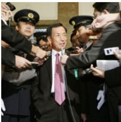
Gen. Tamogami enjoying the spotlight following his dismissal

By early November 2008, every major newspaper and mainstream television station in Japan had reported on the events surrounding Air Self-Defense Force Chief of Staff Gen. Tamogami Toshio: his dismissal from the Defense Ministry for provocatively contradicting national policy on the Asia-Pacific War and his later unrepentant testimony before a committee of the National Diet.