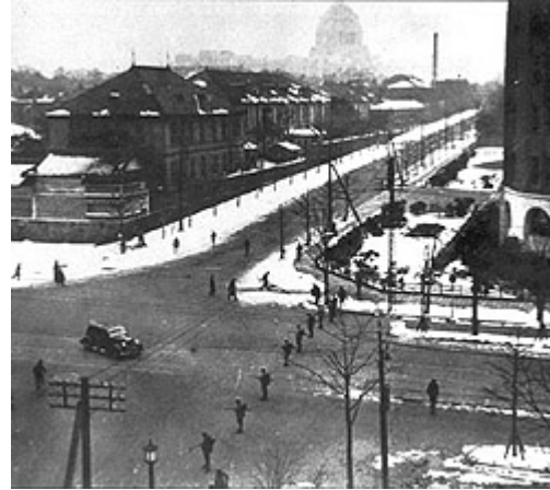
Japan's foreign ministry surrounded by military mutineers in 1936

Reacting against this "sleaze," the military led attempted coups on May 15, 1932 and on February 26, 1936.