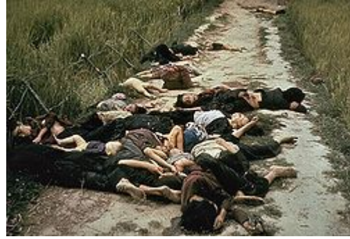
My Lai victims

In late 1969 Seymour Hersh broke the story of the 1968 My Lai massacre, during which US troops slaughtered more than 500 civilians in Quang Ngai Province, far north of the Delta. Some months later, in May 1970, a self-described "grunt" who participated in Speedy Express wrote a confidential letter to William Westmoreland, then Army chief of staff, saying that the Ninth Division's atrocities amounted to "a My Lay each month for over a year." In his 1976 memoir A Soldier Reports , Westmoreland insisted, "The Army investigated every case [of possible war crimes], no matter who made the allegation," and claimed that "none of the crimes even remotely approached the magnitude and horror of My Lai." Yet he personally took action to quash an investigation into the large-scale atrocities described in the soldier's letter.