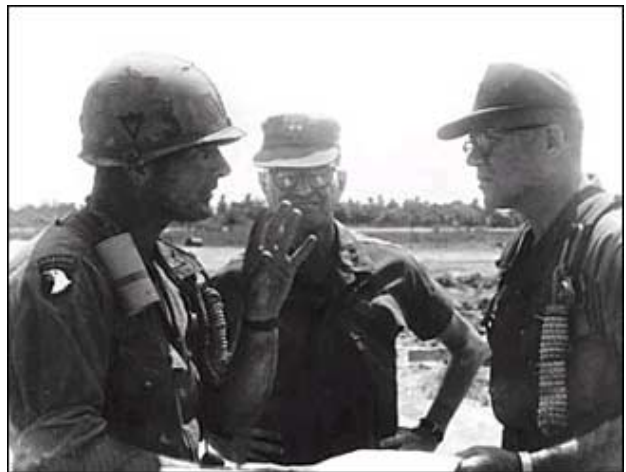
Col. David Hackworth briefs Gen. Julian Ewell (right)

September 1969 Senior Officer Debriefing Report by none other than the commander of the Ninth Division, then Maj. Gen. Julian Ewell, who came to be known inside the military as "the Butcher of the Delta" because of his single-minded fixation on body count. In the report, copies of which were sent to Westmoreland's office and to other high-ranking officials, Ewell candidly noted that while the Ninth Division stressed the "discriminate and selective use of firepower," in some areas of the Delta "where this emphasis wasn't applied or wasn't feasible, the countryside looked like the Verdun battlefields," the site of a notoriously bloody World War I battle.