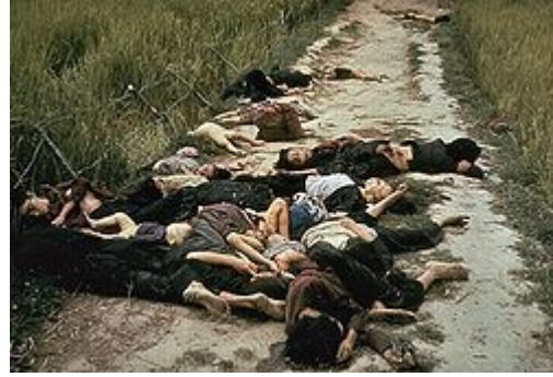
My Lai victims

In late 1969 Seymour Hersh broke the story of the 1968 My Lai massacre, during which US troops slaughtered more than 500 civilians in Quang Ngai Province, far north of the Delta. Some months later, in May 1970, a self-described "grunt" who participated in Speedy Express wrote a confidential letter to William Westmoreland, then Army chief of staff, saying that the Ninth Division's atrocities amounted to "a My Lay each month for over a year." In his 1976 memoir A Soldier Reports , Westmoreland insisted, "The Army investigated every case [of possible war crimes], no matter who made the allegation," and claimed that "none of the crimes even remotely approached the magnitude and horror of My Lai." Yet he personally took action to quash an investigation into the large-scale atrocities described in the soldier's letter.