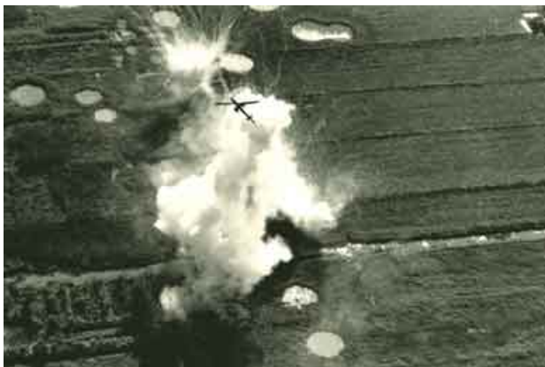
A helicopter gunship pulls out of an attack in the Mekong Delta during Speedy Express, January 1969.