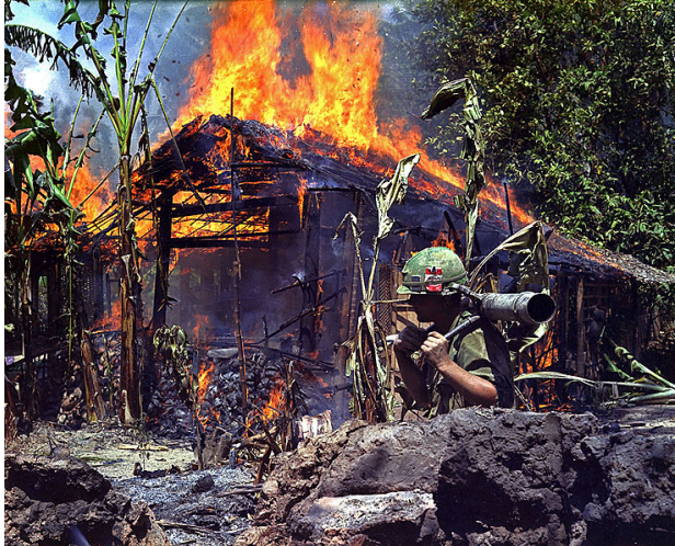
Burning a "Viet Cong base camp" in the Mekong delta, June 3, 1968 at Cai Lay

The sergeant wrote that the unit's policy was to shoot not only guerrilla fighters (whom US troops called Vietcong or VC) but anyone who ran. This was the "Number one killer" of unarmed civilians, he wrote, explaining that helicopters "would hover over a guy in the fields till he got scared and run and they'd zap him" and that the Ninth Division's snipers gunned down farmers from long range to increase the body count. He reported that it was common to detain unarmed civilians and force them to walk in front of a unit's point man in order to trip enemy booby traps. "None [of] us wanted to get blown away," he wrote, "but it wasn't right to use...civilians to set the mines off." He also explained the pitifully low weapons ratio: