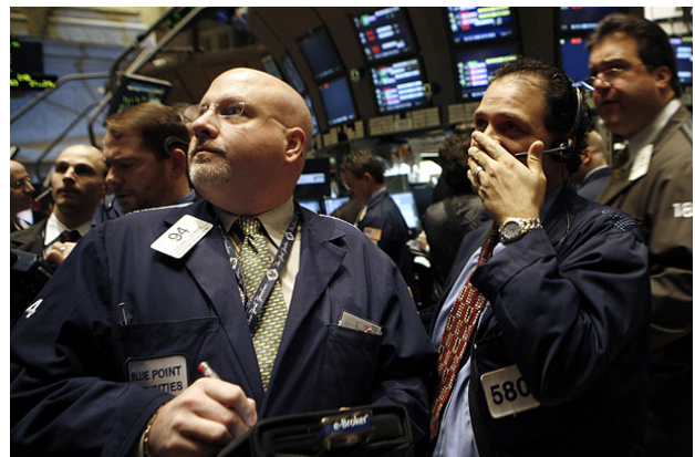
The stock market in free fall in October-November, 2008

health of the country has undergone a gory public dissection. And yet, as Barack Obama prepares to take office, one particularly frightening problem has escaped public notice; indeed, it may not even make the agenda of the global summit being held this weekend, dubbed "Bretton Woods II" after the postwar system of currency controls. The international monetary system is in big trouble.