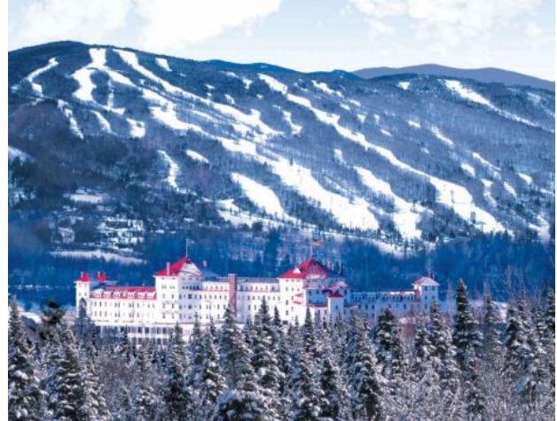
Site of the Bretton Woods conference

The original Bretton Woods system dates from a conference at a New Hampshire resort hotel in July 1944. Leading British and American economists blamed the Great Depression and, to some extent, World War II on the breakup of the international monetary system in the early 1930s and were determined to create a more stable arrangement in which the dollar would replace the British pound as the accepted global currency. The new system, devised by economists Harry Dexter White and John Maynard Keynes, fixed the dollar's value at $35 for an ounce of gold. National governments, rather than speculators, were to set the value of their currencies in relation to the dollar and would have to disclose any changes in advance to the new International Monetary Fund (IMF).