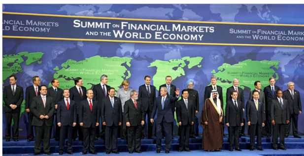
G-20 leaders meet to repair the global financial order

The consequences could be even more dire. In the past, countries in recession could count on countries with growing economies to provide outlets for their exports and investments. The hope this time is that economic growth in Asia and particularly China can backstop a U.S. and European recession. But, as a result of Bretton Woods II, prosperity in the United States is intertwined with prosperity in Asia. China depends on exports to the United States, and the United States depends on capital from China. If that special economic relationship breaks down, as it seems to be doing, it could lead to a global recession that could morph into the first depression since the 1930s.