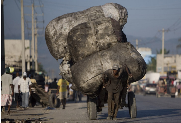
China faces rising unemployment

The consequences could be even more dire. In the past, countries in recession could count on countries with growing economies to provide outlets for their exports and investments. The hope this time is that economic growth in Asia and particularly China can backstop a U.S. and European recession. But, as a result of Bretton Woods II, prosperity in the United States is intertwined with prosperity in Asia. China depends on exports to the United States, and the United States depends on capital from China. If that special economic relationship breaks down, as it seems to be doing, it could lead to a global recession that could morph into the first depression since the 1930s.