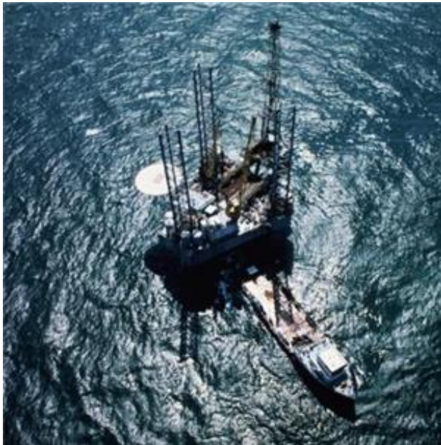
China National Petroleum Company offshore oil rig

monopoly on offshore work. This has changed and now all of the Chinese oil and gas majors can bid for onshore and offshore projects, both local and foreign. Since early 2007, both CNOOC and China's biggest oil producer, China National Petroleum Corporation, have been looking to the South China Sea to supplement declining onshore production. Both have been building deep-water drilling platforms.