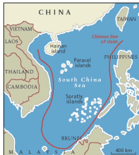
Chinese claims in Spratly Islands area

seismic survey of hydrocarbon resources, agreed in 2005 by the national oil companies of China, Vietnam, and the Philippines, lapsed last July and may not be renewed. Even when it was operational, the tripartite seismic survey did not include the other three Spratly Island claimants. Moreover, it covered only a small part of the contested sea area.