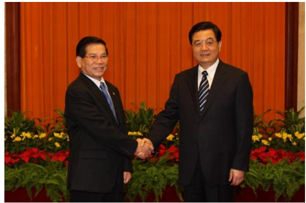
Vietnamese President Nguyen Minh Triet (L) and Chinese President Hu Jintao (R) in Beijing on August 7, 2008

China and Vietnam have outlined new steps to resolve their long-running territorial disputes in the South China Sea in an effort to avert further conflict and put their relations on a steadier footing for the future. Although both countries are ruled by Communist parties and share extensive land and sea borders, they have had a tense relationship. But they now face political challenges at home as their export-oriented economies and investment slow under the impact of global financial turmoil and deepening recession. They have evidently decided to give primacy to strengthening bilateral party, trade and investment ties to offset the wider economic downturn.