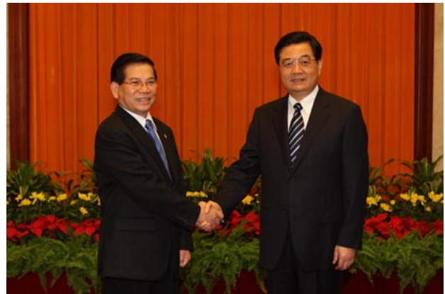
Vietnamese President Nguyen Minh Triet (L) and Chinese President Hu Jintao (R) in Beijing on August 7, 2008

China and Vietnam have outlined new steps to resolve their long-running territorial disputes in the South China Sea in an effort to avert further conflict and put their relations on a steadier footing for the future. Although both countries are ruled by Communist parties and share extensive land and sea borders, they have had a tense relationship. But they now face political challenges at home as their export-oriented economies and investment slow under the impact of global financial turmoil and deepening recession. They have evidently decided to give primacy to strengthening bilateral party, trade and investment ties to offset the wider economic downturn.