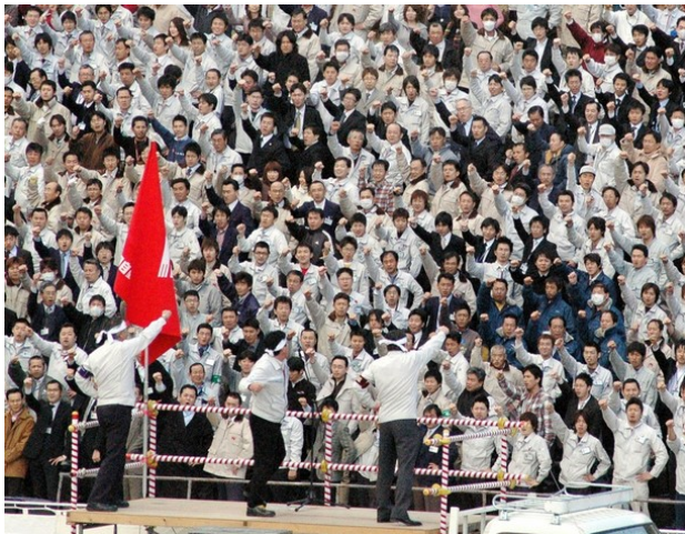
Toyota workers rally for wage hikes

industrial and ideological issues as not part of their responsibilities. For this group of union leaders, industrial or ideological concerns would become the province of the emerging union federations. More recently, although not an explanation of union structure per se, globalization has reinforced enterprise union structures both within Japan and in offshore operations.