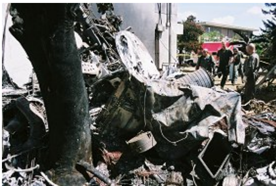
Marines inspect wreckage at the site of the crash

That evening a friend drove me through some backstreets, avoiding roadblocks, and we managed to get into the university, as far as the yellow tape blockade. Standing behind the tape was a line of Marine MPs, pistols on their belts. Behind them, Marines were dismantling the wrecked helicopter and loading it into trucks (from a police standpoint, destroying the evidence).