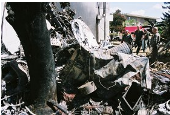
Marines inspect wreckage at the site of the crash

That evening a friend drove me through some backstreets, avoiding roadblocks, and we managed to get into the university, as far as the yellow tape blockade. Standing behind the tape was a line of Marine MPs, pistols on their belts. Behind them, Marines were dismantling the wrecked helicopter and loading it into trucks (from a police standpoint, destroying the evidence).