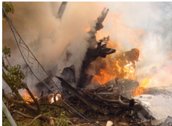
CH-53 in flames

Miraculously, no one other than the crew was injured. But what happened afterward was just as extraordinary.