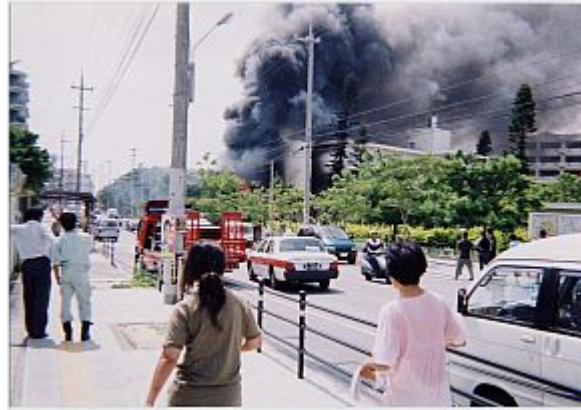
Toxic smoke blazes from the wreckage

In August 2004, on Friday the 13th, a helicopter from the US Marine Air Station at Futenma smashed into the side of a building inside Okinawa International University, fell to the ground, exploded, and burned.