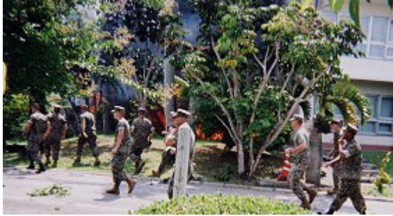
Marines occupy Okinawa International University campus

The incident is telling as to how the US military understands its status in foreign countries. That is, it will obey the status of forces agreements when it's no big inconvenience, but in the case of a crisis, it will operate at will.