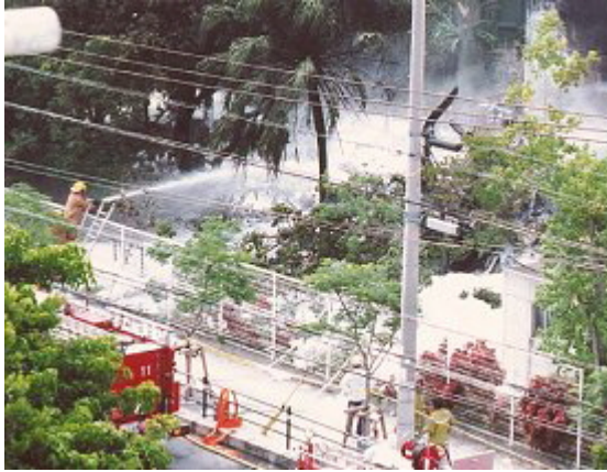
Ginowan City firefighters on the scene

That evening a friend drove me through some backstreets, avoiding roadblocks, and we managed to get into the university, as far as the yellow tape blockade. Standing behind the tape was a line of Marine MPs, pistols on their belts. Behind them, Marines were dismantling the wrecked helicopter and loading it into trucks (from a police standpoint, destroying the evidence).