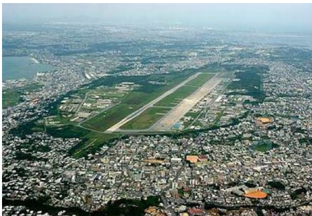
Futenma base in the middle of Ginowan City

The Okinawa experience brings into focus the humiliation of this extraterritoriality, but a recent incident here raises another question: When push comes to shove, to what extent is the US military willing to abide by even its own agreements?