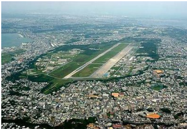
Futenma base in the middle of Ginowan City

The Okinawa experience brings into focus the humiliation of this extraterritoriality, but a recent incident here raises another question: When push comes to shove, to what extent is the US military willing to abide by even its own agreements?