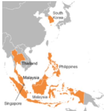
Countries most affected by the 1997 Asian Financial Crisis

shape in the wake of the American debacle; discussions that carry with them all kinds of risks.