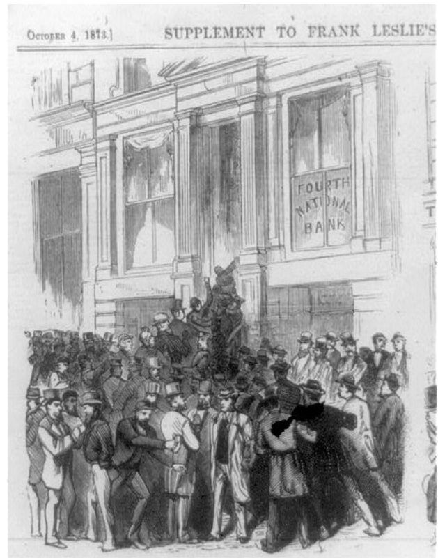
Bank run of 1873

or accountable executives and regulators.