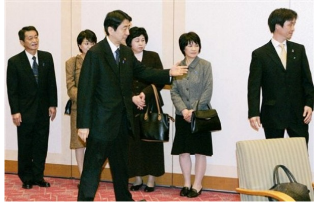
Abe and five abductees who were returned to Japan. February 25, 2007

Clearly, the single-issue politics served Abe well. By making normalization conditional to progress in the abductees issue, Japan simultaneously secured greater international interest and maintained a powerful tool to punish North Korea for lack of progress. Some may conclude that narrow domestic political interests simply prevailed over broader strategic purposes. At a deeper level, however, Abe's policy may be thought of as a conscious attempt to set the bilateral and multilateral political agenda in a context that is framed by a North Korean regime first and foremost interested in negotiating with Washington. Tokyo is generally relegated to the sidelines, expected to provide economic assistance when time is ripe. With little to lose bilaterally and lots to gain domestically and strategically, Abe insisted on this one issue. An obstructing stance furthermore assures that multilateral engagement does not move too fast without real concessions from Pyongyang.