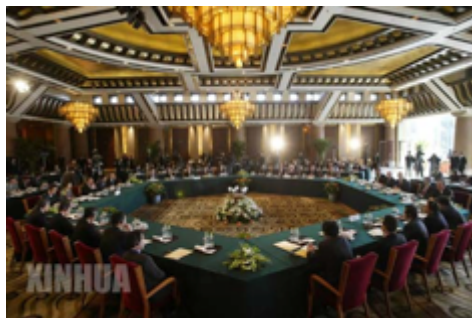
The Six-Party Talks negotiating table (entrance behind PRC seat).

From a security perspective, Japan's concerns over North Korea's nuclear and missile programmes appear to be at odds with its (in)action in negotiations addressing these issues. When taking a closer look, however, it becomes apparent that while Tokyo recognizes