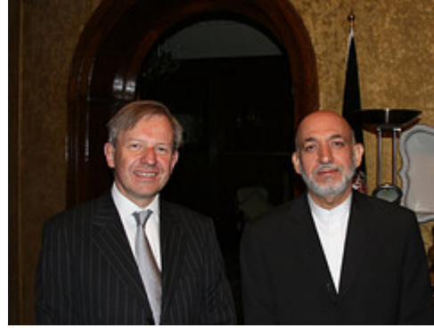
Cowper-Coles and Karzai

Within 5 to 10 years, the only "realistic" way to unite [Afghanistan] is for it to be "governed by an acceptable dictator," the cable said, adding that "we should think of preparing our public opinion" for such an outcome.