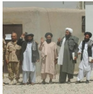
Karzai administration officials and Taliban rebels negotiate

In an exclusive interview to Geo television channel, Karzai said, Through Pakistan television channel Geo I propose Mullah Omar to get back to Afghanistan as I will be wholly and solely responsible for his security and I shall be answerable to the whole of the world on his behalf.