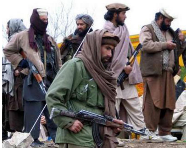
Taliban fighters in South Waziristan, their stronghold in Pakistan

Despite brave chest-beating in the national press about the need to make the war on terror Pakistan's war, it appears that the Taliban has done a very good job of convincing Pakistani opinion that peace in the heartland and accommodation on the borderlands is preferable to a titanic struggle against intermeshed Pashtun and Islamic conservative interests.