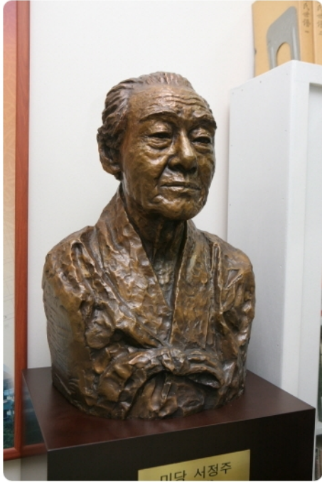
A bronze statue of Sŏ Jŏng-ju. While respected as Korea's greatest poet, the controversy surround his work as a pro-Japanese writer continues to rage in Korea.

In the text he is portrayed as a hardworking and sincere person who wakes up before dawn every morning in order to clean the house and garden, make breakfast for his mother, and help his son get ready for school.