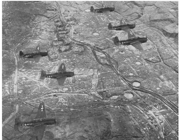
US planes over Southern Okinawa during the 1945 Battle

(from the 1996 "Guidelines" to the 2005-6 " Beigun Saihen " or US military realignment), and governments in Tokyo have done their best to comply. My understanding of this is that these measures deepen and reinforce Japan's dependence and therefore its irresponsibility, transforming the long-term dependent and semi-sovereign Japanese state of the Cold War into a full "Client State." [1] Far from pursuing its own "values, traditions, and practices," (as other scholars have argued) 21st century Japan scraps them in order to follow American prescriptions, and the present political confusion stems at root from this identity crisis.