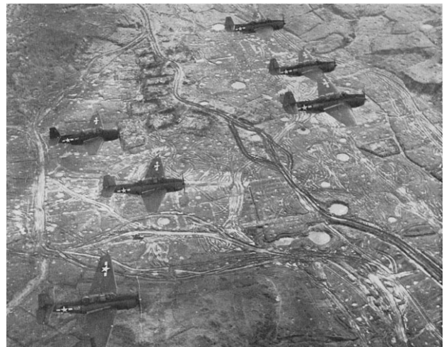
US planes over Southern Okinawa during the 1945 Battle

(from the 1996 "Guidelines" to the 2005-6 " Beigun Saiheru " or US military realignment), and governments in Tokyo have done their best to comply. My understanding of this is that these measures deepen and reinforce Japan's dependence and therefore its irresponsibility, transforming the long-term dependent and semi-sovereign Japanese state of the Cold War into a full "Client State." [1] Far from pursuing its own "values, traditions, and practices," (as other scholars have argued) 21st century Japan scraps them in order to follow American prescriptions, and the present political confusion stems at root from this identity crisis.