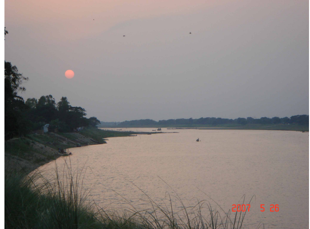
A view of the Brahmaputra River

A Sino-Indian conflict over the sharing of the Brahmaputra waters would begin no sooner than China began to build the world's largest hydropower plant on the river's Great Bend.