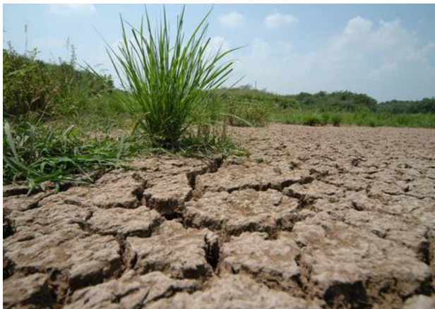
China's looming water shortages

Their rapid economic growth could slow in the face of acute water scarcity if their demand for water continues to grow at the present frenetic pace. Water shortages indeed threaten to turn food-exporting China and India into major importers — a development that would seriously accentuate the global food crisis.