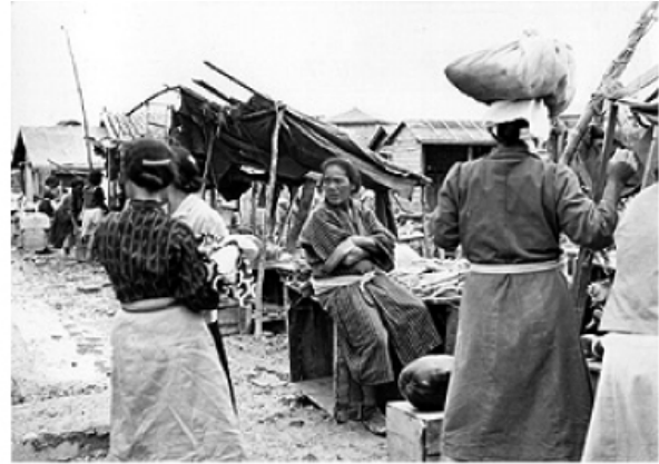
Figure 3. Black Market Scene in Naha, Okinawa, circa 1948

developed simultaneously with the geographical distribution of the US military bases and black markets.