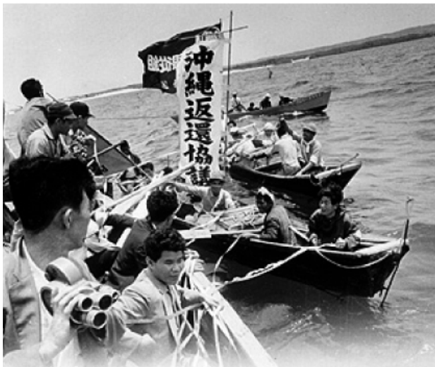
Figure 4. 4.28 Rally at Sea (4.28 kaijō shūkai) at the 27th Parallel Border

Even after the reversion of the Amami Islands in 1953, residents in the Ryukyus continued to challenge the external boundaries that denied them free passage into Japan. Ishihara Masaie has keenly observed that the annual "4.28 rally at sea" (4.28 kaijō shūkai) held during the height of the Okinawa reversion movement in the 1960s was reminiscent of earlier smuggling operations.[97]