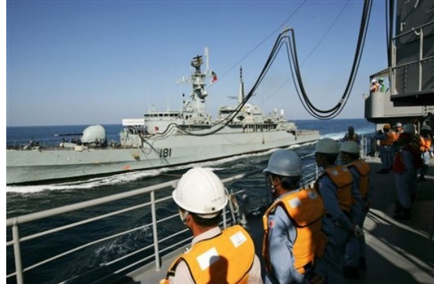
MSDF crew watch refuelling of a Pakistani ship in the Indian Ocean on October 29, 2007

The MSDF was first dispatched to the Indian Ocean in support of coalition operations against international terrorism in Afghanistan and the surrounding region in November 2001. [8] After the expiry in November 2007 of the original legislation authorising the MSDF mission, the Replenishment Support Special Measures Law in January 2008 passed the lower house for the second time on January 11, 2008, in order to open the way to "contributions to efforts by the international community for the prevention and eradication of international terrorism." [9]