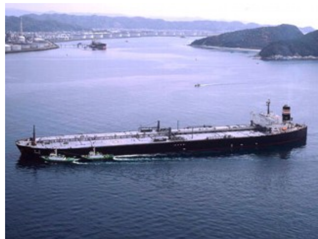
Japan oil tanker Takenaka was attacked off the coast of Yemen in April 2008