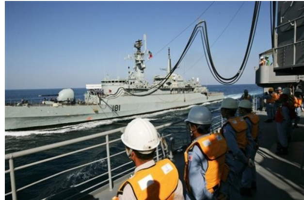
MSDF crew watch refuelling of a Pakistani ship in the Indian Ocean on October 29, 2007

The MSDF was first dispatched to the Indian Ocean in support of coalition operations against international terrorism in Afghanistan and the surrounding region in November 2001. [8] After the expiry in November 2007 of the original legislation authorising the MSDF mission, the Replenishment Support Special Measures Law in January 2008 passed the lower house for the second time on January 11, 2008, in order to open the way to "contributions to efforts by the international community for the prevention and eradication of international terrorism." [9]