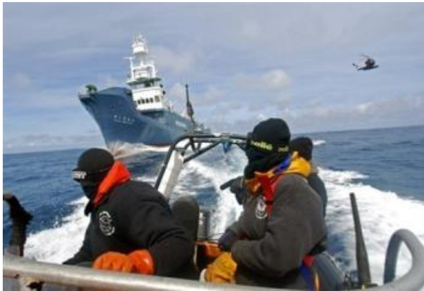
Japanese whaler Yushin Maru watched by Sea Shepherd members in a speedboat

Japanese prosecutors will seek international arrest warrants through Interpol for three Sea Shepherd members for their activities against Japanese whaling in the Southern Ocean in 2007. [34]