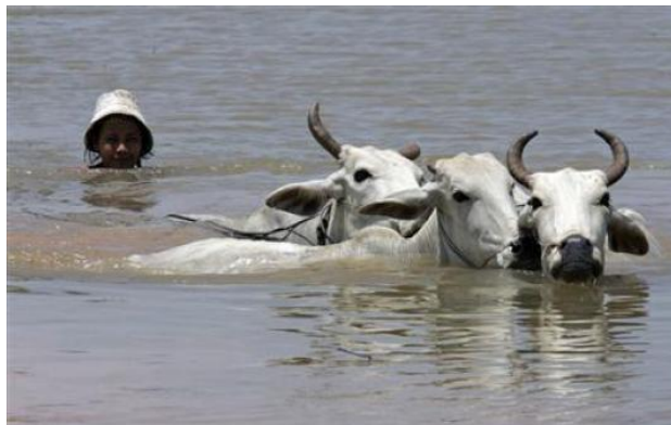
A woman guides bulls to higher ground in the Mekong near Phnom Penh

Thailand has estimated damages at around 220 million baht (US$6.48 million), while the Vientiane Times , a state-controlled Lao newspaper, cited an unofficial government report that the floods would cost Luang Prabang province alone some 100 billion kip (US$11.6 million). Those figures may only be provisional, as flood waters in the Mekong Delta have already reached critical levels and Vietnamese forecasters have predicted more flooding before the end of the rainy season.