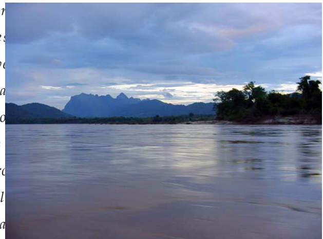
The Mekong in Laos

about one US dollar a day, with the weight of poverty falling most heavily upon the ethnic minorities. Alongside globalization and regionalism, however, nationalism still holds sway (the ongoing spat between Thailand and Cambodia over ownership of a border temple is just one example). It also appears the way that ethnic labeling or "taxonomic" control over national minorities takes precedence, above all in the communist states (China, Laos and Vietnam), and do powerful official narratives of common history. In a word, the concerned nations seek to assimilate their