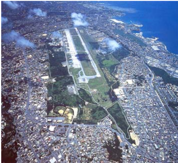
Futenma Base in crowded Ginowan

acted as if Japan was its occupied territory and closed off the accident site, thus disrupting the work of Japanese police and fire fighters. On top of this, it was the Defense Agency's Naha Facilities Administration Agency (now the Ministry of Defense, Okinawa Defense Administration Agency) that repeatedly apologized over the accident and paid compensation for the damage to the university.