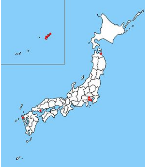
US bases in Japan