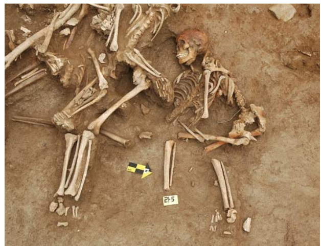
Photograph of remains of some of 110 victims executed by ROK forces at Cheongwon. Released by TRC in 2007

abuses by the state; incidents of dubious conviction and suspicious death, including 1,200 incidents of mass civilian sacrifice committed by ROK forces and US forces (215 cases). In 2007 the TRC has excavated 4 among the 160 suspected mass graves. Then President Roo Moo-hyun has apologized to the citizens for the 870 victims confirmed at Ulsan. South Korea now has a new government and the TRC is currently fighting budget cuts and restrictions in order to complete its daunting and painful task.