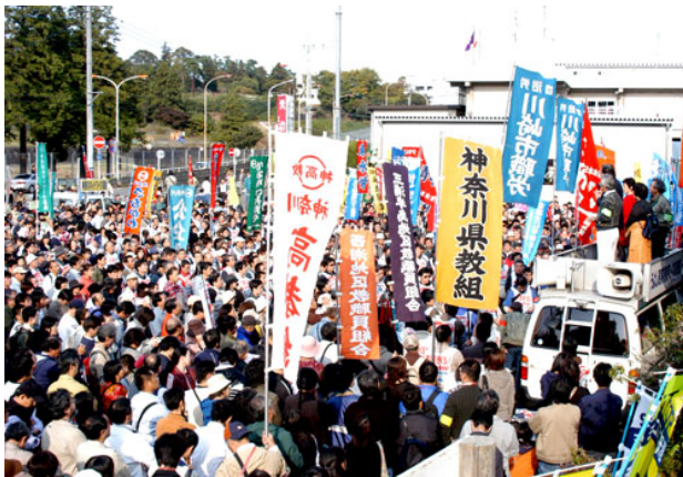
Protest against base reorganization plan outside Camp Zama in 2005

present Zama City is the sole local district penalized for non-cooperation under the under the 2007 law for facilitating the reorganization of US Forces in Japan. The mayor of Zama, who has sworn that he will stand firm even if the government (Japanese, US, or both) were to target him with a Cruise missile, faces election for a 7th term in August 2008.