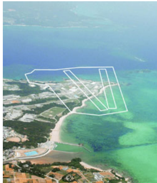
The Henoko base construction plan for twin runways

the heliport of 1996 had evolved into a monster comprehensive sea and air-base, with twin, V-shaped, 1,600 metre runways, to be constructed on the almost pristine marine environment, where a precious colony of blue coral was only discovered during 2007, where the protected dugong graze on sea-grasses, turtles come to rest, and multiple rare birds, insects and animals thrive.