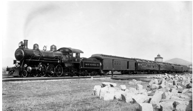
South Manchurian Railroad . . . symbol of Japanese power and industrialization

recruit Chinese supporters at the lowest levels of this enterprise. We are left to decide just how self-delusionary was the Mantetsu agent who saw himself fulfilling the great mission of saving China and Asia in the face of the unimaginable horrors perpetrated by his military.