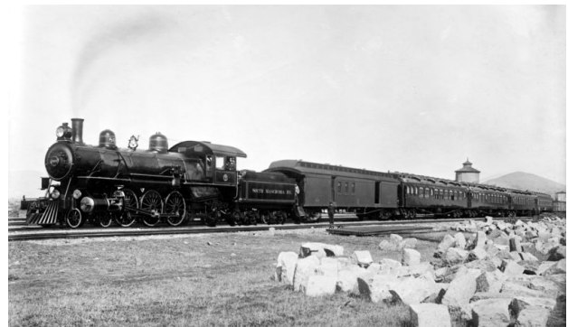
South Manchurian Railroad . . . symbol of Japanese power and industrialization

recruit Chinese supporters at the lowest levels of this enterprise. We are left to decide just how self-delusionary was the Mantetsu agent who saw himself fulfilling the great mission of saving China and Asia in the face of the unimaginable horrors perpetrated by his military.