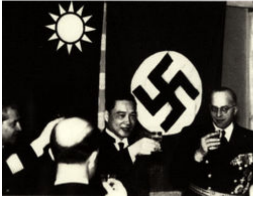
Wang Jingwei hosting Nazi visitors as head of State of the collaborationist regime with its capital at Nanjing from 1940

the wide spectrum of real conditions and motivations that induced some Chinese to work with the Japanese.