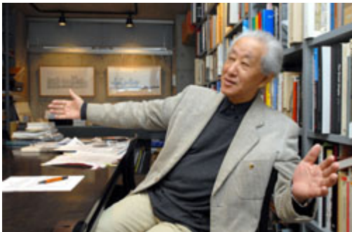
Isozaki Arata at his Roppongi studio in Tokyo.

If the entire Japanese architectural fraternity was one big royal family, then Isozaki Arata would be a king approaching the end of a long and glorious reign.