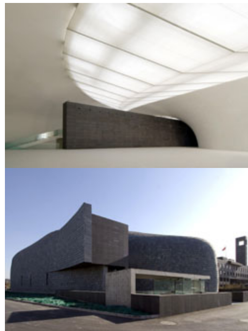
Isozaki's curvy new design for the Museum of Contemporary Art at the Central Academy of Fine Arts in Beijing, due for completion in October, seen inside and from the outside.

example, the Domus: La Casa del Hombre in La Coruna in Spain, which was a museum focusing on the human body. It was completed in 1995. That was one of the first jobs that incorporated organic curves. At that time, works using curves started appearing more and more. The Central Academy job is a continuation of that, but at the same time, it further develops it. The entire structure there is complex and organic.