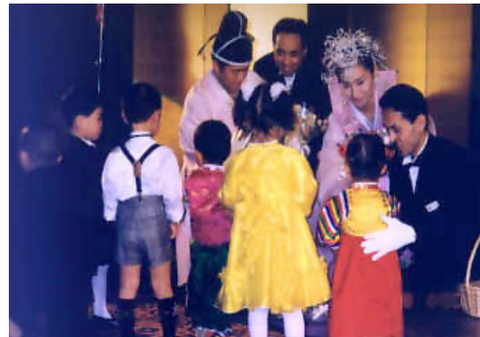
Young Koreans in Japan celebrate wedding in traditional Korean style.

marginalized ethnic minority, once it begins to receive the benefits of the affluence of the host society, albeit belatedly, would shed its markings of ethnicity and begin to take on the markings of class. Perhaps it is also logical to think that in such a situation class, rather than ethnicity, would become more relevant to forging identity. Unequivocally, however, I remain unconvinced by the argument that a particular category becomes "more significant" than certain others, since the marking of the oppressed is always necessarily multiply compounded.