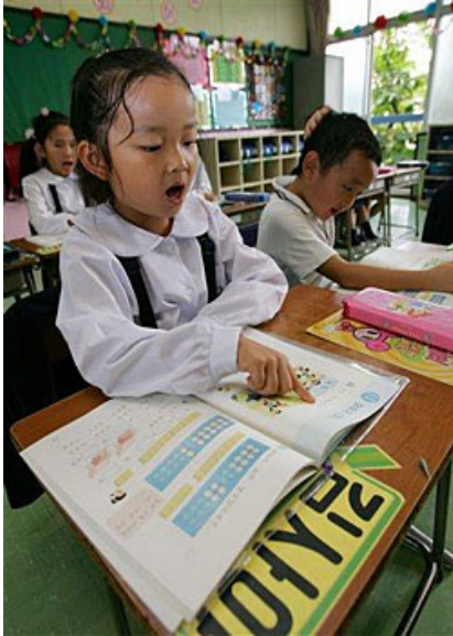
Ethnic Korean students study at a Chongryun-funded elementary school in Tokyo. 2007.

In short, by 1955, within three years of being deprived of Japanese citizenship, Koreans in Japan (or at least Chongryun and its affiliates, which accounted for the majority of Koreans at the time) had banished or exiled themselves from the Japanese civic terrain. During the period when their status had been ambiguous, that is to say, in 1949, when they were not legally excluded from Japanese citizenship status under the Occupation, they were “outlawed”; in 1952, they were excluded from Japanese civic entitlements; in 1955, Koreans themselves embraced this marginalization by effectively declaring that they had no wish to be counted within Japan’s civic life.