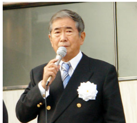
Ishihara Shintarō, the governor of Tokyo

amendment of Article Nine of the Constitution need to be understood in this context, since this amendment would enable Japan to declare war against other nations: the possibility of war is the possibility of emergency, and further, a state of emergency is a state in which non-nationals can be exterminated more easily than at other times. Controversial behavior by the governor of Tokyo, Ishihara Shintarō, should also be seen in this light, that is, as evidence of a craving to declare a legal civil war in order to eliminate undesirable elements. Of particular note is his 2000 reference to foreigners and immigrants as daisangokujin or “third country nationals,” a term used to denote non-Japanese, non-Allied nationals (i.e. former colonial subjects) in occupied Japan, branding them as responsible for social unrest. (During the same period, public school teachers that were sympathetic to the Koreans and/or resistant to the singing of Kimigayo Japan's national anthem that reveres the Emperor, were criticized and punished).[21]