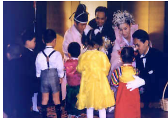
Young Koreans in Japan celebrate wedding in traditional Korean style.

marginalized ethnic minority, once it begins to receive the benefits of the affluence of the host society, albeit belatedly, would shed its markings of ethnicity and begin to take on the markings of class. Perhaps it is also logical to think that in such a situation class, rather than ethnicity, would become more relevant to forging identity. Unequivocally, however, I remain unconvinced by the argument that a particular category becomes "more significant" than certain others, since the marking of the oppressed is always necessarily multiply compounded.